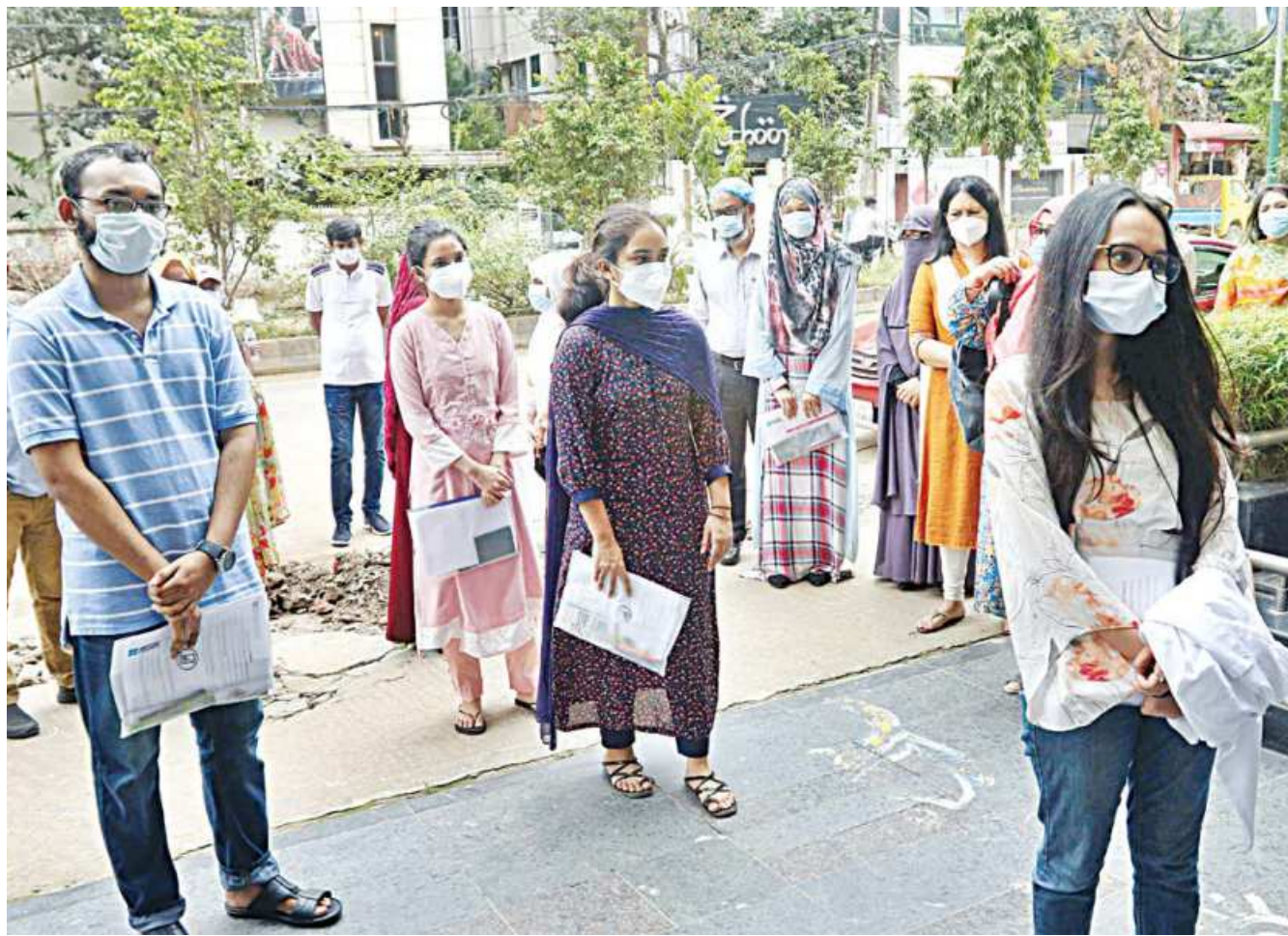
Wearing masks and maintaining physical distancing, a group of A-Level students waits to enter a British Council-approved test centre in the capital's Dhanmondi area around 11:00pm yesterday. Advanced Level examinations of the October and November session began yesterday amid the pandemic, leaving many candidates and their guardians in anxiety over health safety.