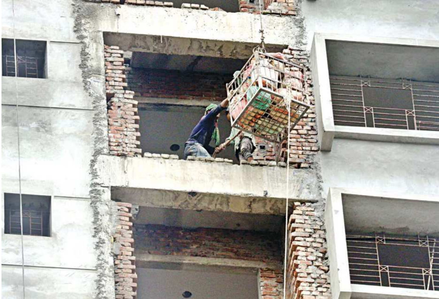
Construction workers getting materials from a roof-top crane at a building in the capital's Azimpur area yesterday. They have no safety gear on and the opening has no guard rails. Three workers died after falling from a 10-storey under-construction building in Dhanmondi-32 area on Monday.