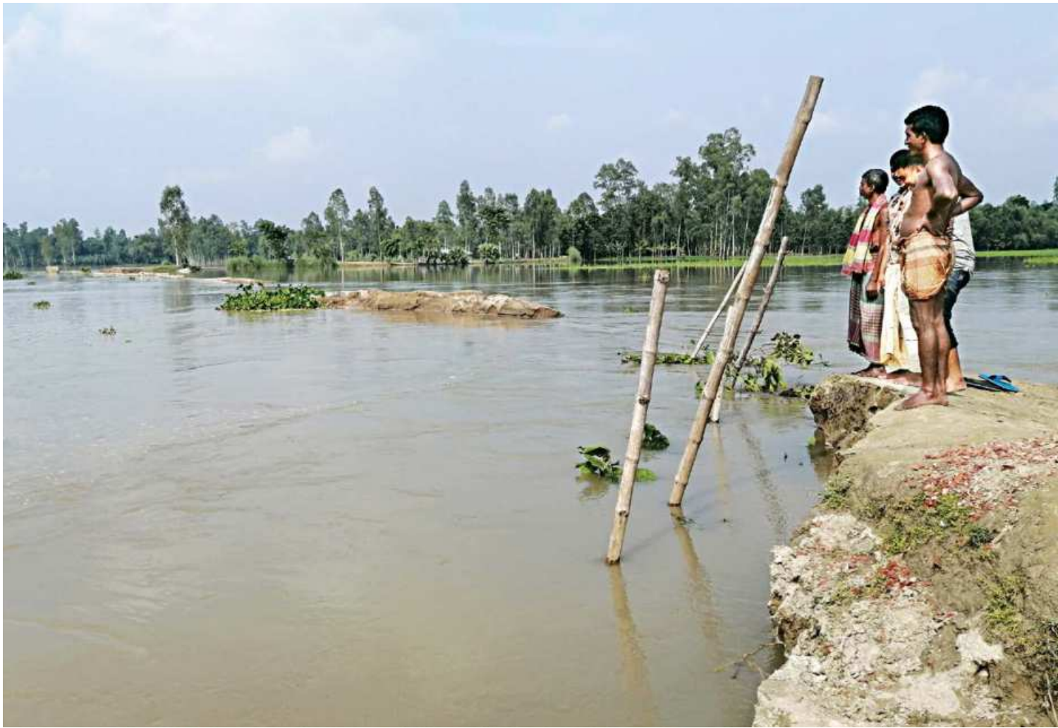
Villagers watch as water of the Karatoa river rushes through a breach in the embankment in Tongadaha of Rangpur's Pirganj upazila yesterday. The embankment gave away the night before, damaging crops on over 1,000 hectares and flooding 13 villages.