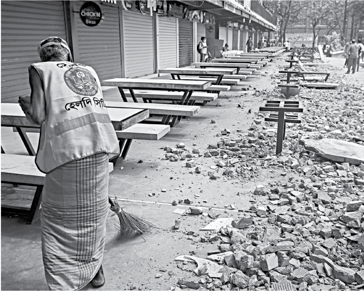
An unapproved seating arrangement -- made of concrete and steel -- near the port city's Biplob Uddyan was demolished by a mobile court of Chattogram City Corporation.

A team of Police Bureau of Investigation and a bomb disposal unit yesterday visited the spot.