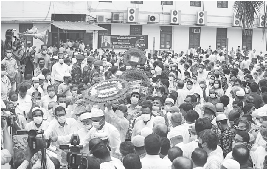
Hundreds of well-wishers joined the namaz-e-janaza of Attorney General Mahbubey Alam at Supreme Court Bar Association premises.

Mahbubey Alam was appointed as the attorney general of the state on January 13, 2009. At the same time, he also performed as the ex-officio chairman of Bangladesh Bar Council.