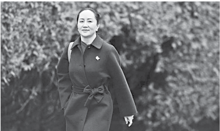
Huawei Chief Financial Officer Meng Wanzhou leaves her home to attend her extradition hearing at BC Supreme Court in Vancouver, British Columbia, Canada .

States and Canada. Soon after Meng’s detention, China arrested Canadian citizens Michael Spavor and Michael Kovrig, charging them with espionage.