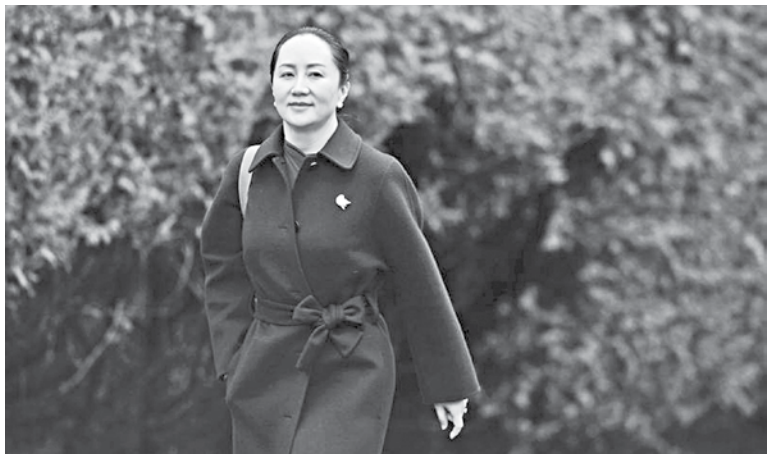
Huawei Chief Financial Officer Meng Wanzhou leaves her home to attend her extradition hearing at BC Supreme Court in Vancouver, British Columbia, Canada .

States and Canada. Soon after Meng’s detention, China arrested Canadian citizens Michael Spavor and Michael Kovrig, charging them with espionage.