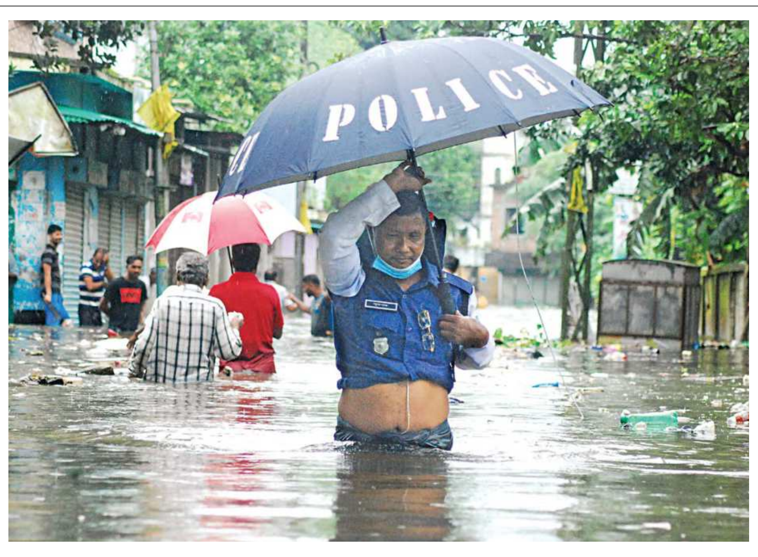
A traffic police wades through waist-deep water on a road in Mulatol area of Rangpur city yesterday. Related story on page 3.

Fazr Zohr Asr Maghrib Esha AZAN 4-35 12-45 4-15 6-00 7-30 JAMAAT 5-10 1-15 4-30 6-05 8-00 SOURCE: ISLAMIC FOUNDATION