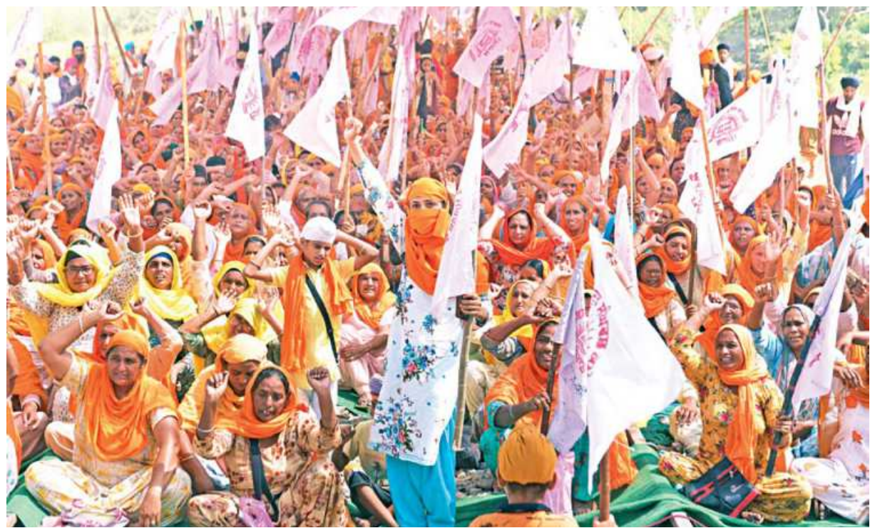
Farmers shout slogans as they block railway tracks during a protest against Indian Prime Minister Narendra Modi's government following the recent passing of new farm bills in parliament, on the outskirts of Amritsar, yesterday.

In Australia, Victoria Premier Daniel Andrews said Melbourne residents are free from today to leave their homes for work, exercise, shop for essentials, or provide care after active cases in the state fell below 400 for the first time since June 30. The relaxation of the curfew, imposed August 2, comes after 16 new infections and two deaths were reported yesterday.