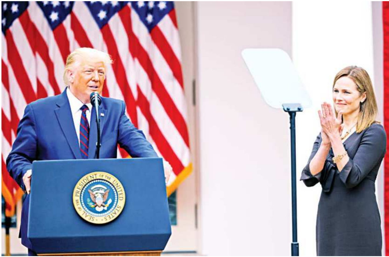
US President Donald Trump holds an event to announce his nominee of US Court of Appeals for the Seventh Circuit Judge Amy Coney Barrett to fill the Supreme Court seat left vacant by the death of Justice Ruth Bader Ginsburg, who died on September 18, at the White House in Washington, on Saturday. Trump yesterday said the Senate will "easily" confirm his Supreme Court nominee Barrett before the election, despite furious Democratic opposition to his bid to steer the court rightward for years to come.