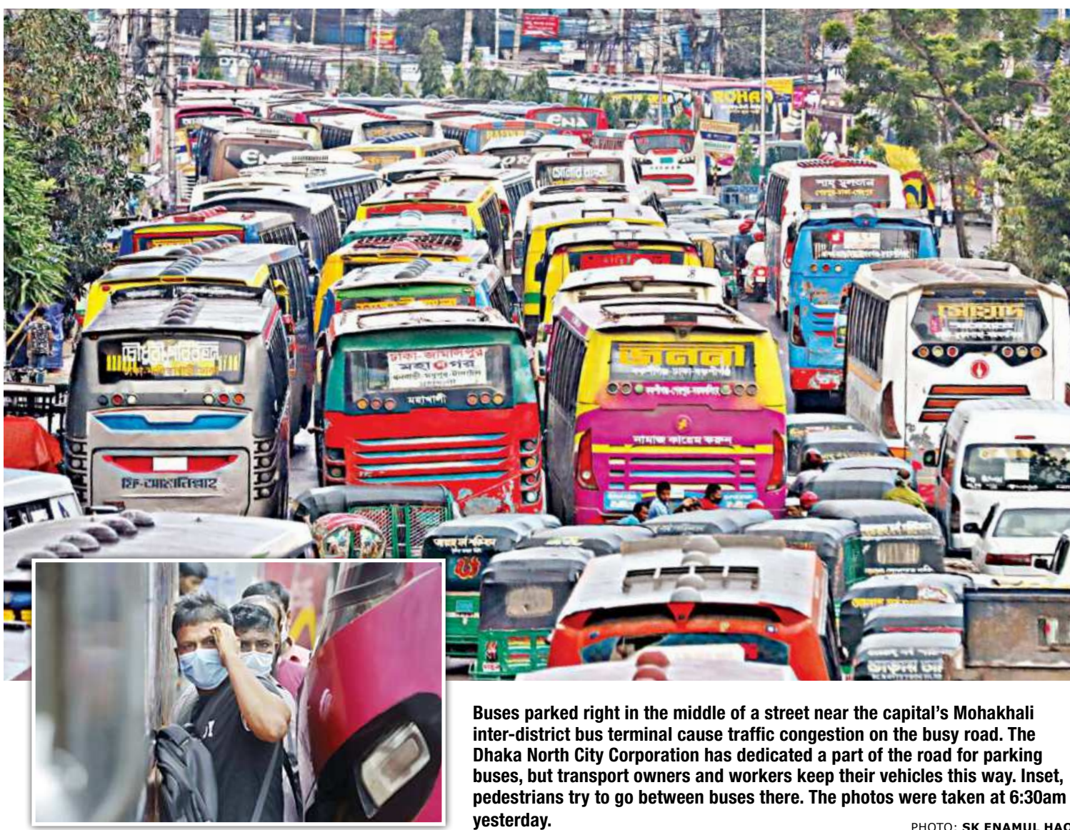
Buses parked right in the middle of a street near the capital's Mohakhali inter-district bus terminal cause traffic congestion on the busy road. The Dhaka North City Corporation has dedicated a part of the road for parking buses, but transport owners and workers keep their vehicles there. Inset, pedestrians try to go between buses there. The photos were taken at 6:30am yesterday.

VOICES RAISED FOR RAPE VICTIMS -- PHOTOS ON PAGE 3