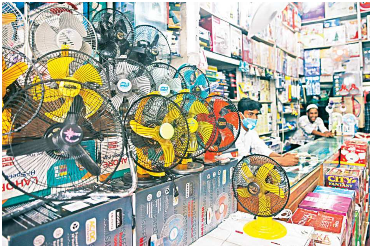
Shopkeepers selling electronic products await customers in New Market on Saturday afternoon. The home electronics sector is suffering from a slide in demand with sales likely to stay below 70 per cent of annual target as consumers are reluctant to spend on these items amid the lingering pandemic, according to market players.