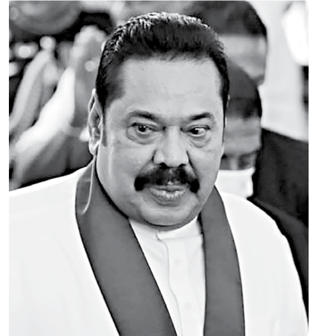
Sri Lanka's Prime Minister Mahinda Rajapaksa

He told Modi that the Sri Lankan government's policies will facilitate deeper economic and strategic cooperation between the two countries.