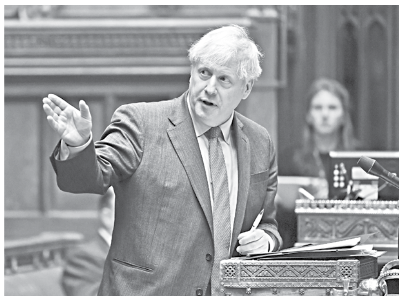
Britain's Prime Minister Boris Johnson makes a statement on the coronavirus disease in the House of Commons, in London.

"The prospect of the European Court of Justice and the European Commission continuing to issue orders to the UK and endless legal wrangling truly means we face a nightmare on Brexit street unless we break free from their clutches at the 11th hour."