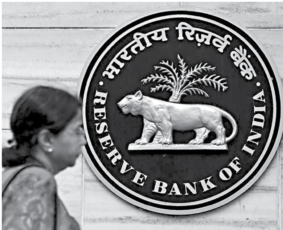
A woman walks past the Reserve Bank of India head office in Mumbai.