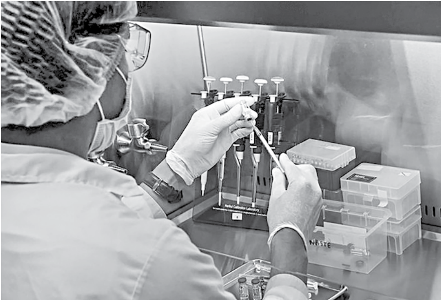
A laboratory technician fills a syringe with a COVID-19 novel coronavirus vaccine candidate ready for trial on monkeys at the National Primate Research Center of Thailand at Chulalongkorn University in Saraburi.

the proposed strategic framework should include market review and monitoring, assessment of costs, storage, distribution and supportive governance and managerial mechanisms. Monitoring trends and progress and assessing market To add further value to our preparedness exercise, it is necessary to closely track and monitor current trends and progress in vaccine production worldwide. It is important to urgently proceed on advance negotiations (on cost, quality and delivery) and finalise agreement with governments and key pharmaceutical companies worldwide. We need to consider options of procuring/obtaining vaccines from multiple sources depending on our comparative advantages and overall health-related interests. The policy choices may revolve around whether we should wait for further details on the effectiveness factor or