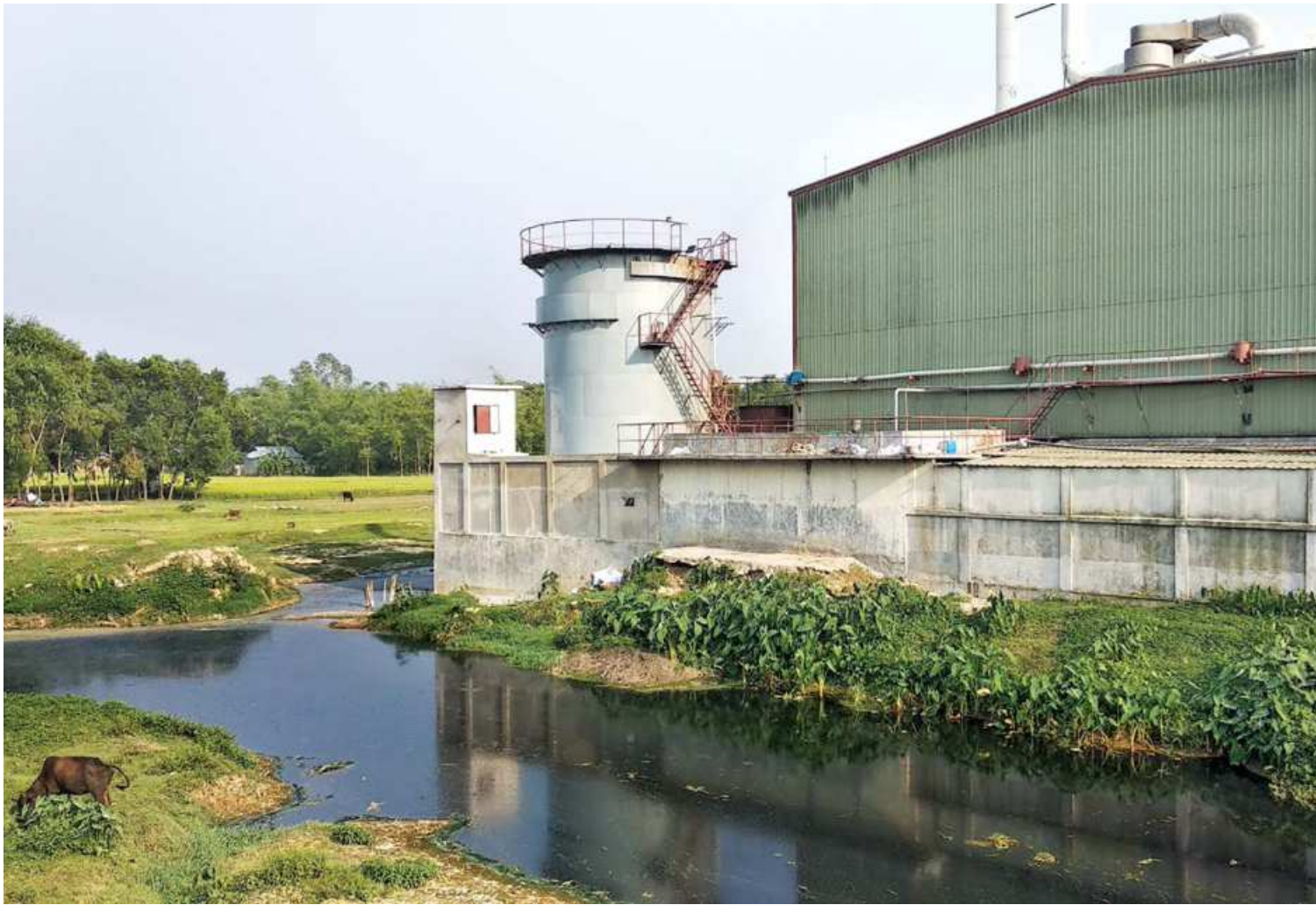
An agro refinery factory dumps toxic industrial waste into Ekhtiarpur Canal in Habiganj's Madhabpur upazila, turning the water dark, causing severe water pollution, and immense public sufferings. Today is World Rivers Day 2020 with the theme Waterways in our Communities. The photo was taken recently.