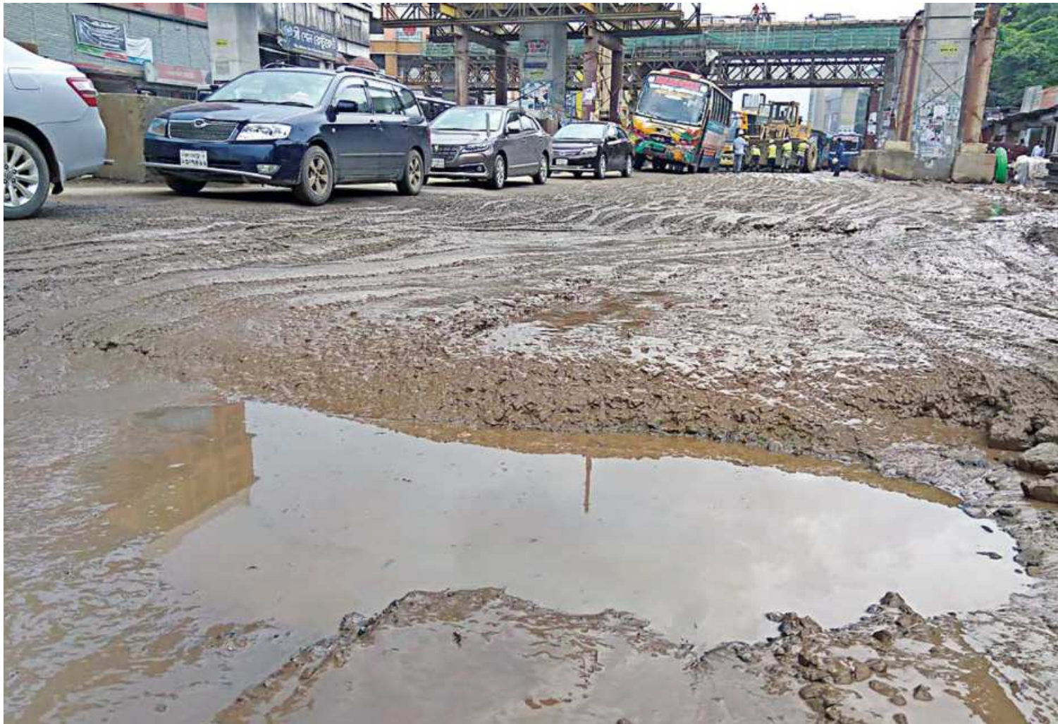
Large potholes on the Dhaka-Mymensingh highway near Abdullahpur in the capital. The section of the road used by vehicles going to Mymensingh division and the northeast. The road has become prone to accidents due to its poor condition. Repairs have been made but those did not help. The photo was taken on Friday.