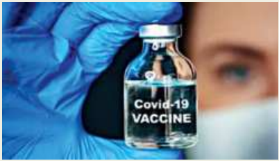
Aussie PM promises support for WHO-led Covax UK pledges over $400 million for WHO, urges end to 'ugly rifts'

has given notice that the United States will pull out of the World Health Organization, calling it biased toward China, and has refused to promise to share Covid research, fearing theft of intellectual property from US pharmaceutical companies.