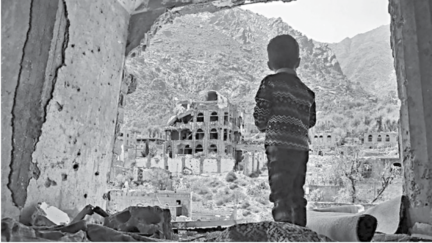
A photo taken on March 18, 2018, shows a Yemeni child looking out at buildings that were damaged in an air strike in the southern Yemeni city of Ta'ez.