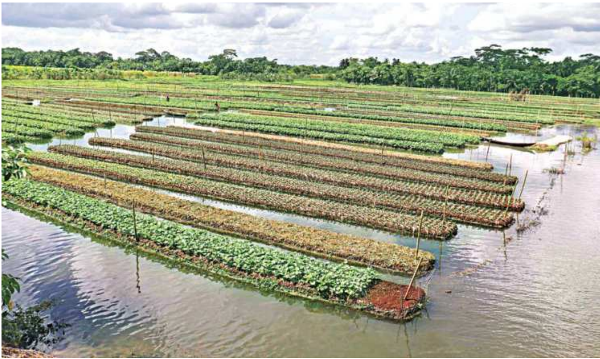
Rows of floating seedbeds used by farmers in Mugar Jhor area of Pirojpur's Najirpur upazila. The method is a blessing for farmers in the area which is mostly marshland.

However, it is unclear whether elderly people, one of the populations most at risk from the virus, will be protected to the same degree as younger people with the J&J vaccine.