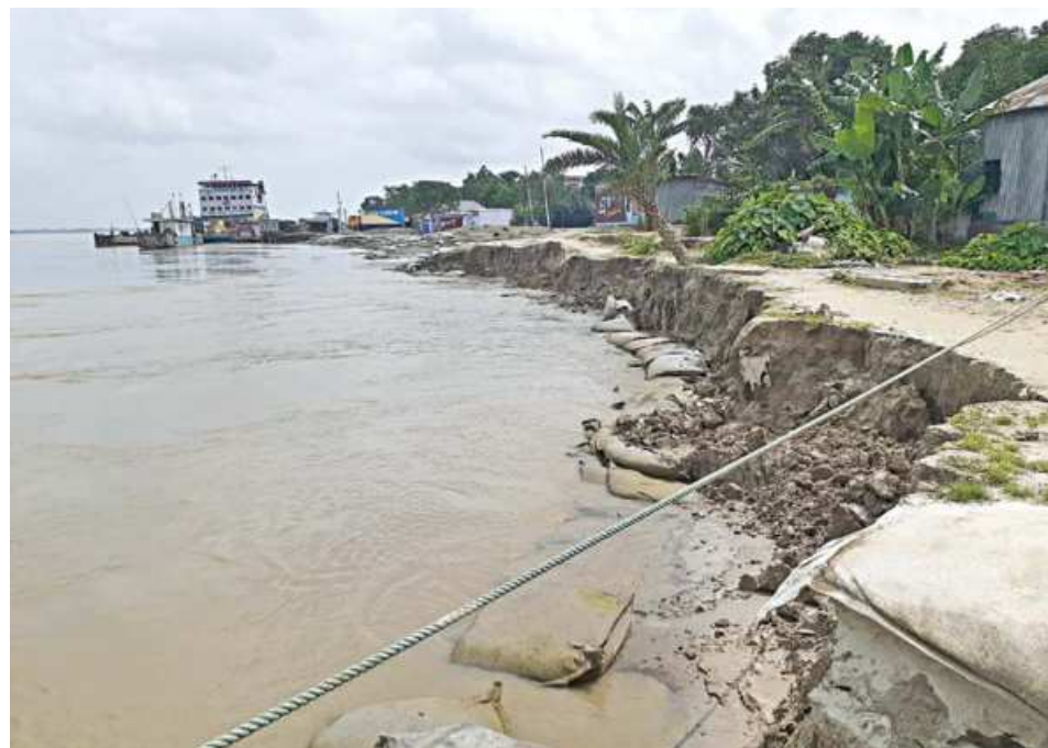
Rapid erosion by the Padma near Doulatdia ferry terminal in Rajbari's Goalanda upazila is likely to devour part of the terminal and at least 20 homesteads. The photo was taken on Friday afternoon.