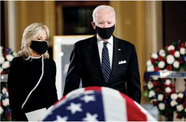
Joe Biden and his wife pay their respects to the late justice Ruth Bader Ginsburg as her casket lies in state in the Statuary Hall of the US Capitol, in Washington, DC; and people react seeing Donald Trump during a campaign rally in Florida. Photos were taken on Friday.

He will commit an initial 71 million pounds to Covax to secure purchase rights on 27 million doses, and 500 million to a separate Covax initiative to help poorer countries access a vaccine.