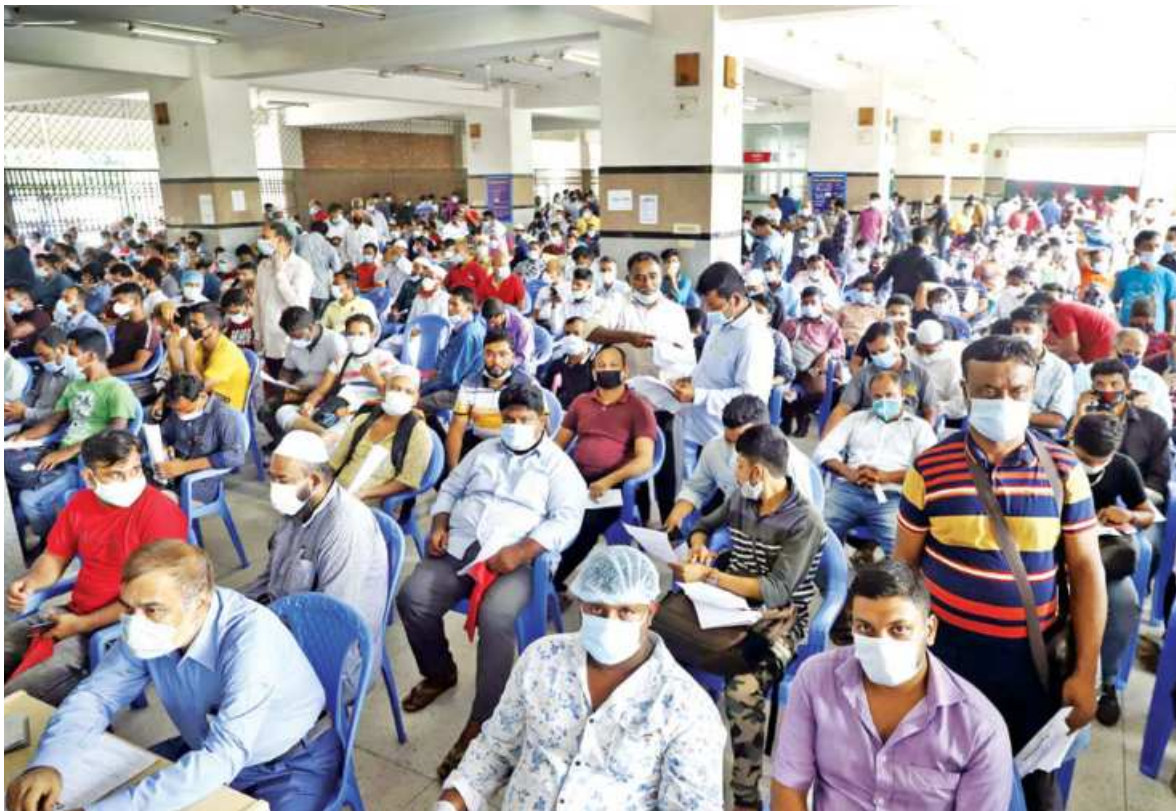
People about to travel out of the country, mostly to join their workplaces in the middle eastern nations including Saudi Arabia, waiting at Dhaka North City Corporation kitchen market for their turn to get tested for the coronavirus. Thousands of expatriates, whose jobs and residency in foreign lands were at the stake due to flight shortage, have finally got hold of plane tickets. The photo was taken yesterday.