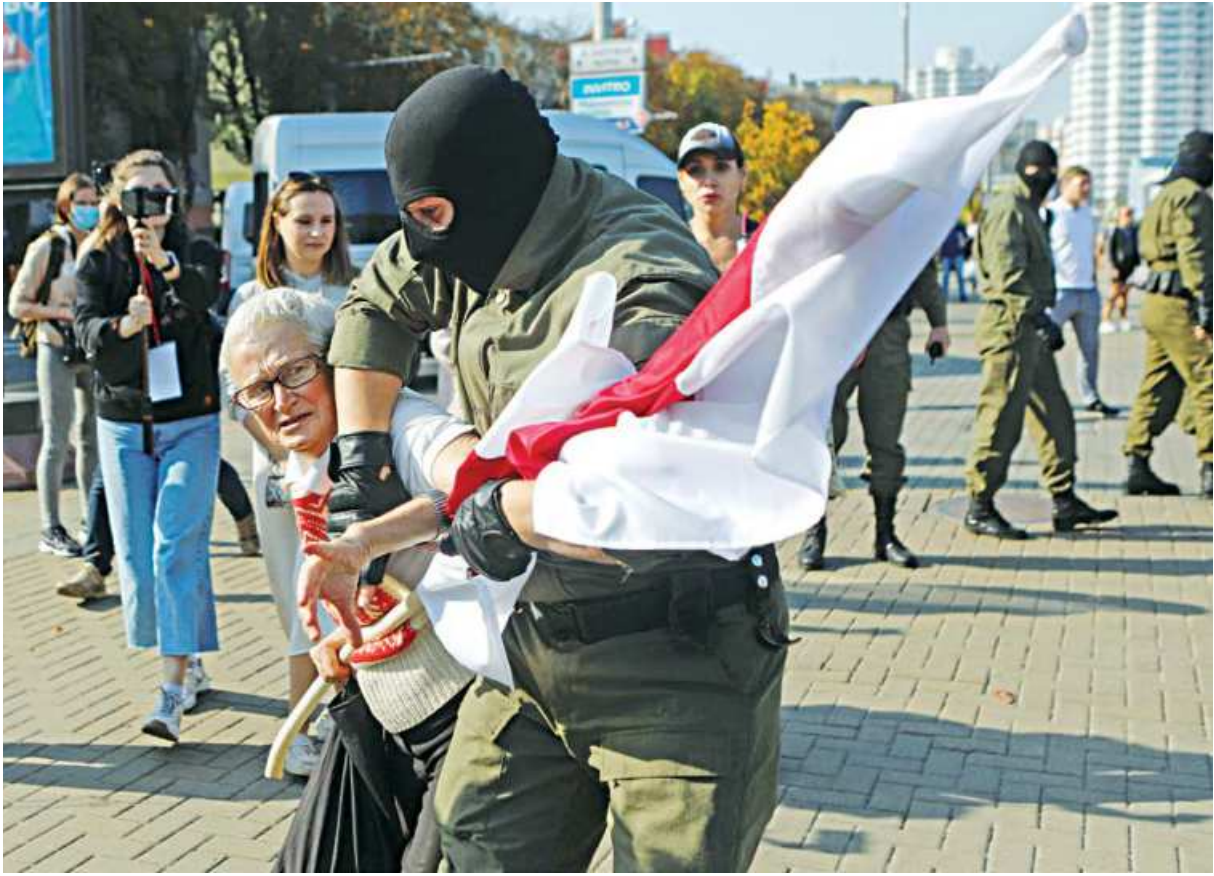
A Belarusian law enforcement officer detains an activist during an opposition rally to reject the presidential election results and to protest against the inauguration of President Alexander Lukashenko in Minsk, Belarus, yesterday. At least 10 protesters were detained yesterday, a Reuters reporter witnessed.

"Since President Trump's last visit to Florida just two weeks ago, over 40,000 more Floridians have tested positive for coronavirus and the state marked 13,000 Covid-related deaths," Biden said Thursday as Trump flew to a Jacksonville rally. "President Trump does not have a plan, but I do -- to beat Covid-19, build our economy back better, and protect and build upon the Affordable Care Act."