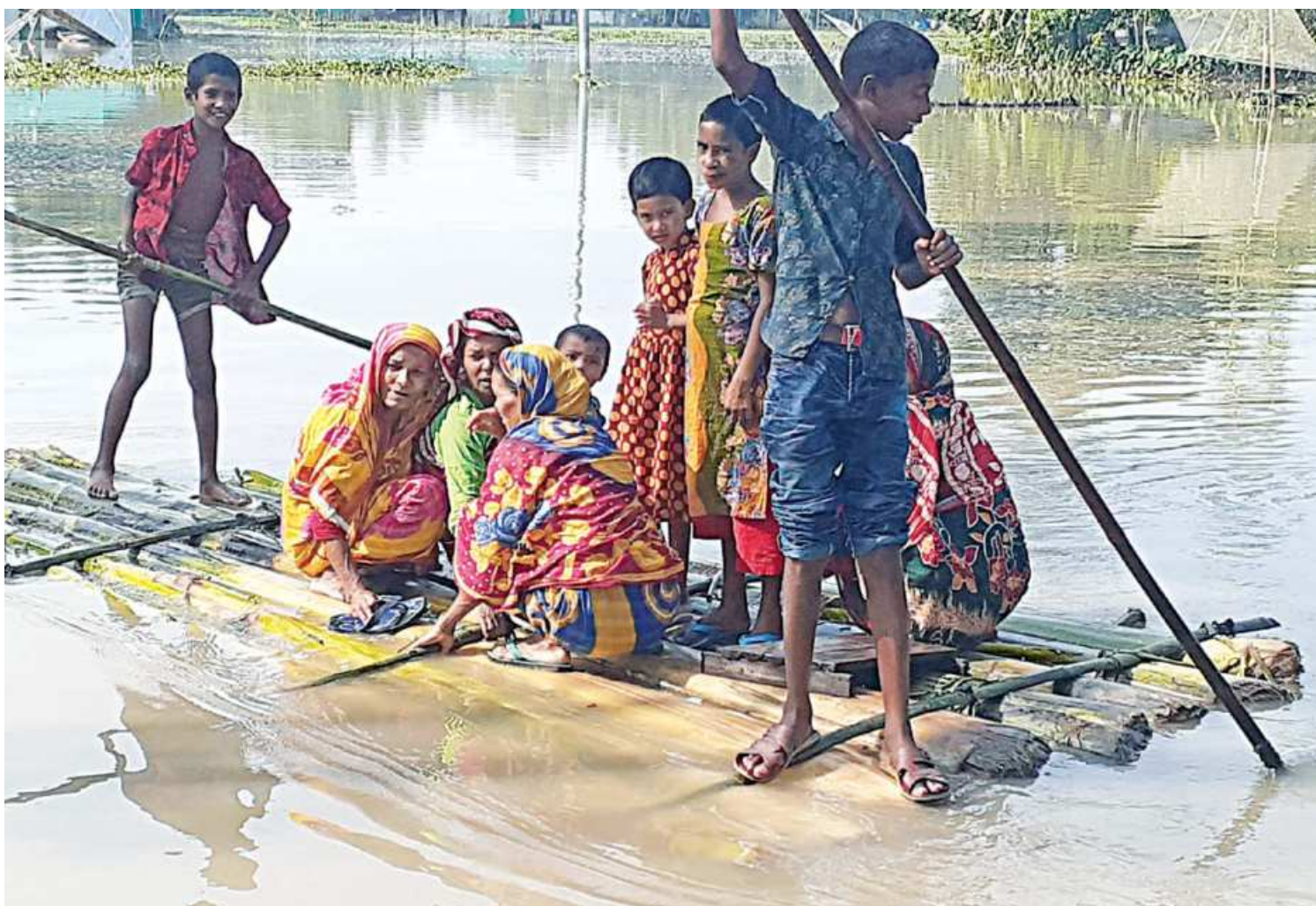
Some locals ride on a raft made of banana trunks to go to a dry place in Chowraha village of Lalmonirhat's Aditmari upazila yesterday. The village went under water a week ago as all five upazilas of the district have been hit by flood due to onrush of water from upstream and heavy rains. About 70,000 people have been affected by the flood in the district so far.