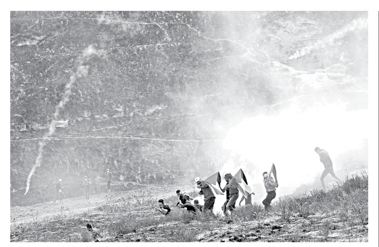
Palestinians run away from tear gas fired by Israeli forces during a protest against Jewish settlements, in Asira al-Qibliya in the Israeli-occupied West Bank yesterday.