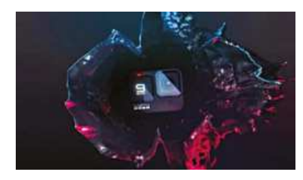
growing from 1.95 to 2.27 inches. The body of the camera has also increased in size, with the battery

Of the features, the most notable change is the front 1.4-inch front-facing display. The screen is designed to help users set up their shots better, especially when filming themselves. The rear touchscreen has also been enlarged,