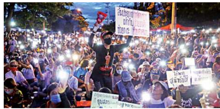
Pro-democracy protesters flash lights from their phones and hold placards during a mass rally to call for the ouster of Prime Minister Prayuth Chan-ocha and reforms in the monarchy in front of parliament in Bangkok, Thailand yesterday.

Mitch McConnell has said he intends to act on any nomination Trump makes. Democrats accuse McConnell of hypocrisy, pointing out he refused to have the Senate even consider Democratic President Barack Obama's nominee to fill a vacant Supreme Court seat in 2016 because it was an election year.