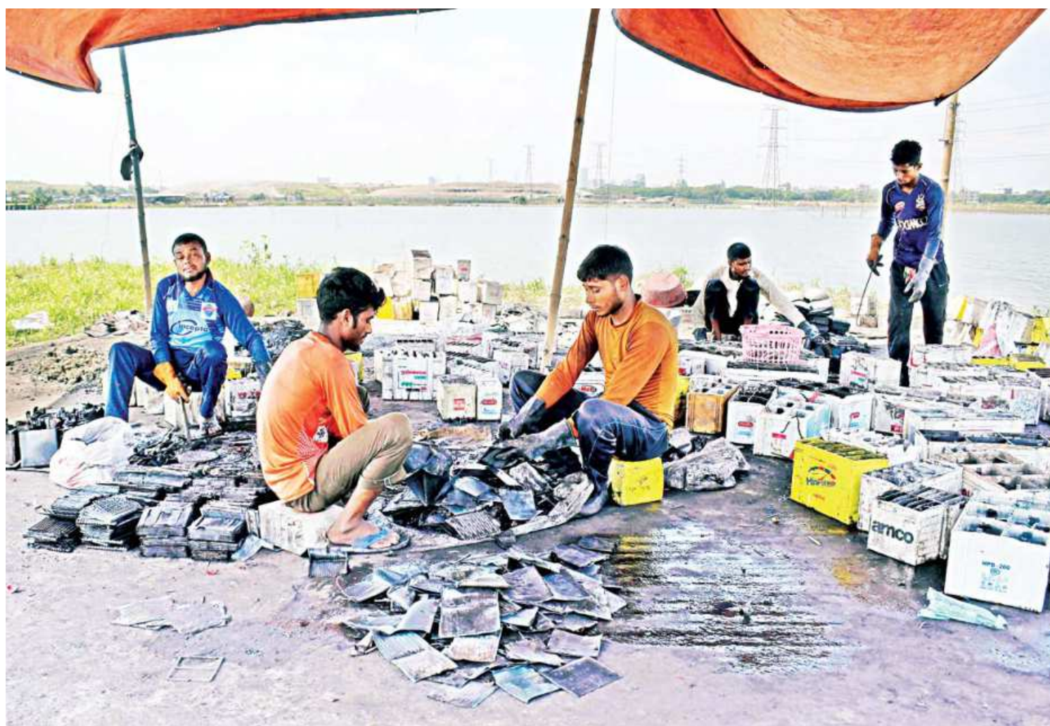
Men taking apart used lead-acid batteries to recycle the parts at an unauthorised and temporary factory in Matuail on the outskirts of the capital. Such factories contribute to the reduction of pollutants in the environment but the business is largely market driven and unregulated.