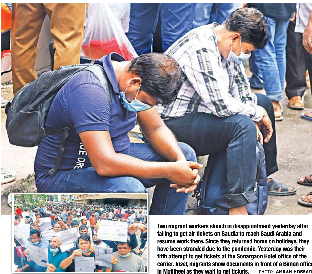
Two migrant workers slouch in disappointment yesterday after failing to get air tickets on Saudia to reach Saudi Arabia and resume work there. Since they returned home on holidays, they have been stranded due to the pandemic. Yesterday was their fifth attempt to get tickets at the Sonargaon Hotel office of the carrier. Inset, migrants show documents in front of a Biman office in Motijheel as they wait to get tickets.