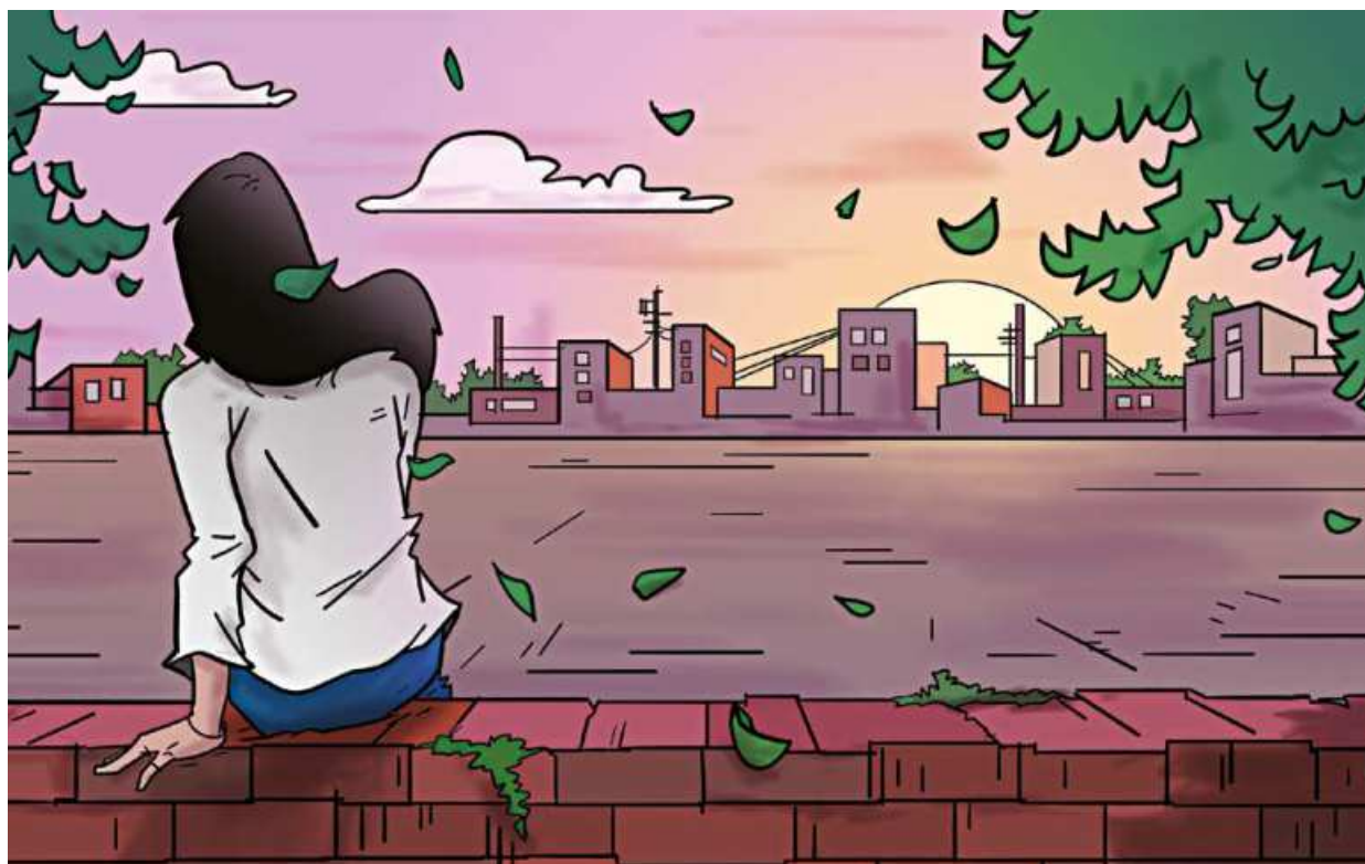
ILLUSTRATION: RIDWAN NOOR NAFIS

Samin Sabah Islam is currently torn between starting a new book and starting a new anime series. Suggest both at sabah-samin11@gmail.com