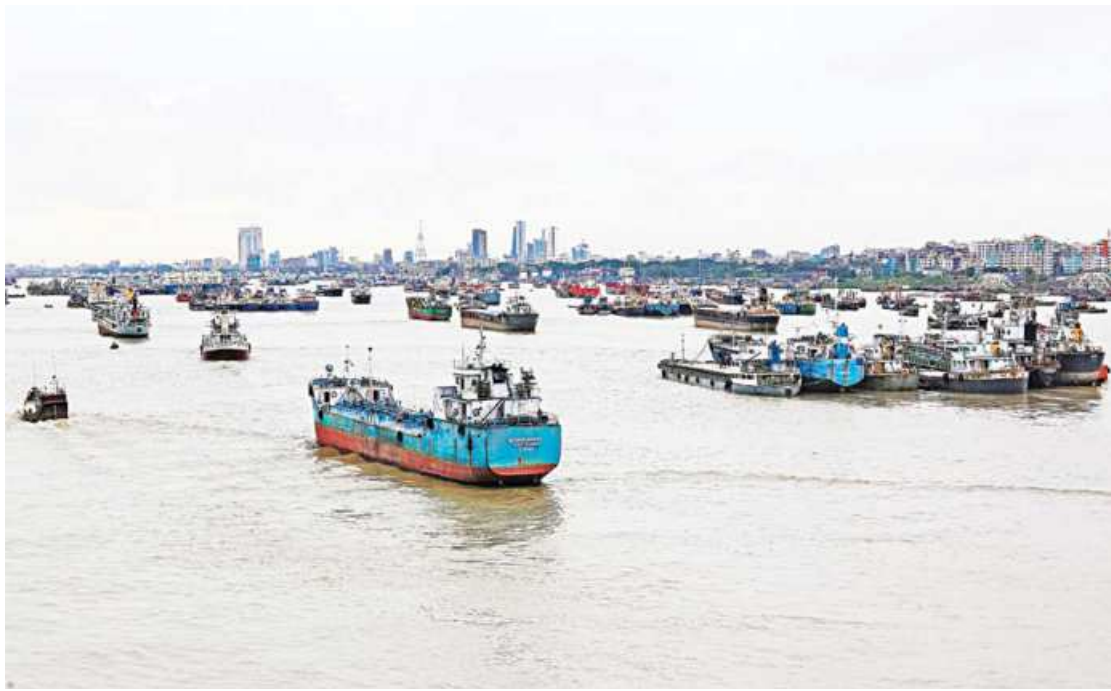
A number of lighter vessels remain idle at the river Karnaphuli as they fail to cross the bay due to inclement weather for the last three days. The photo was taken yesterday.

However, unloading of bulk cargoes from vessels berthed at the port's main jetties continued