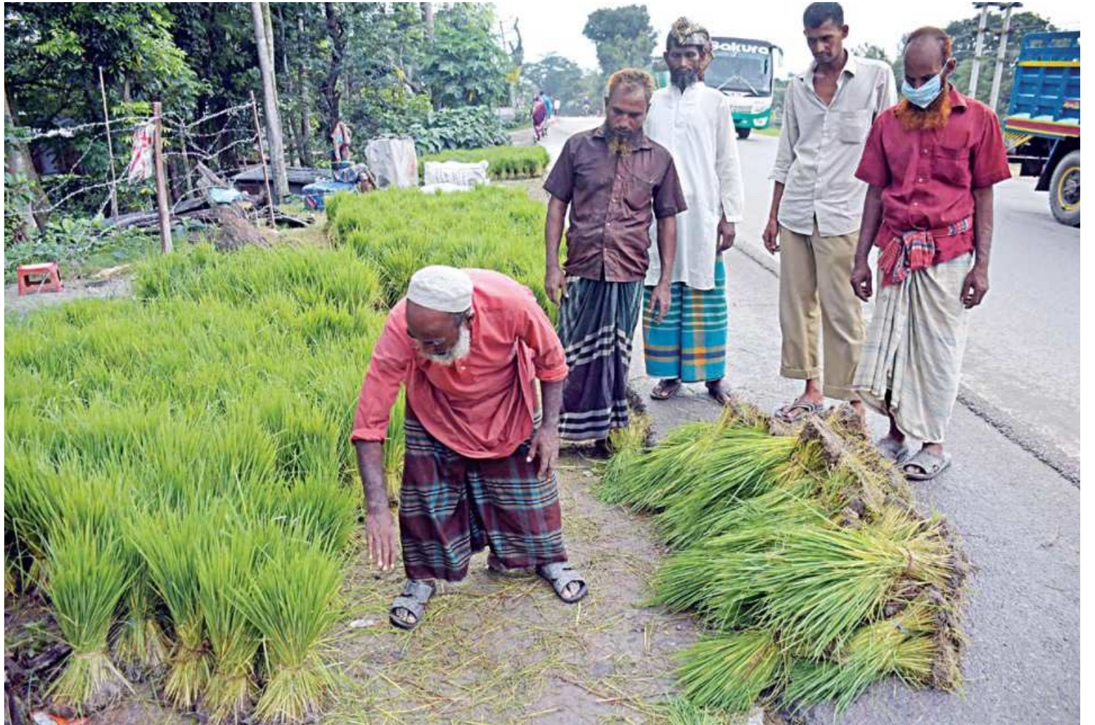
Farmers buying paddy saplings at Tk 10 a bundle at Manikganj bus stand recently to cultivate their lands in tune with receding floodwaters. Prolonged and multiple monsoon floods have disrupted cultivation of Aman paddy, which accounts for around 36 per cent of the country's rice production. The Department of Agricultural Extension suggests farmers go for a late variety of Aman or cultivate winter crops as water recedes.

Shipping Secretary Mohammed Mezbah Uddin Chowdhury and Japanese Ambassador Hirokyu Yamaya were present.