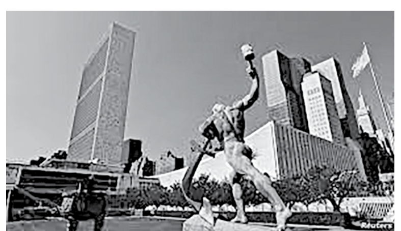
The United Nations headquarters is seen from the North sculpture garden in New York, US.

Since surfacing in China late last year, the novel coronavirus has killed nearly one million people worldwide out of the more than 31 245 million full-time jobs.