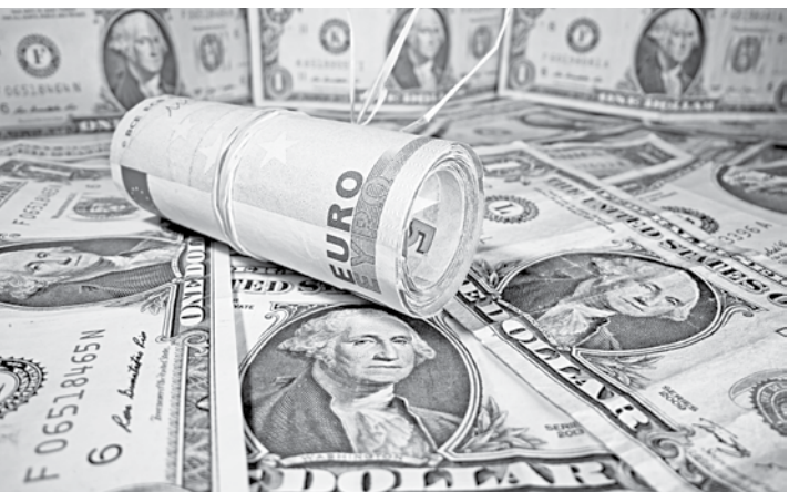
Rolled Euro banknotes are placed on US Dollar banknotes in this illustration picture.