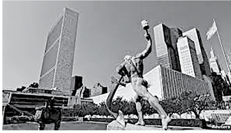
The United Nations headquarters is seen from the North sculpture garden in New York, US.

AFP, Geneva The coronavirus pandemic is taking a heavier toll on jobs than previously feared, the UN said Wednesday, with hundreds of millions of jobs lost and workers suffering a "massive" drop in earnings. In a fresh study, the International Labour Organization (ILO) found that by the mid-year point, global working hours had declined by 17.3 per cent compared to last December -- equivalent to nearly 500 million full-time jobs. That is nearly 100 million more job-equivalents than the number forecast by the ILO back in June, when it expected 14 per cent of working hours to be lost by the end of the second three-month period of the year. "The impact has been catastrophic," ILO chief Guy Ryder told reporters in a virtual briefing, pointing out that global labour income had shrunk by 10.7 per cent during the first nine months of the year compared to the same period in 2019. That amounts to a drop of some $3.5 trillion, or 5.5 per cent of the overall global gross domestic product (GDP), the ILO said. Since surfacing in China late last year, the novel coronavirus has killed nearly one million people worldwide out of the more than 31