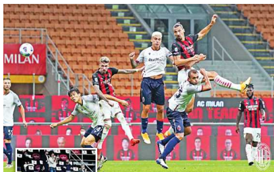
Zlatan Ibrahimovic scored the opening goal with a towering header before adding a second from the spot as AC Milan beat Bologna 2-0 in their opening Serie A fixture at the San Siro on Monday. About a thousand lucky fans were allowed inside the stadium to witness the superb performance from the Swede, who claimed afterwards: "If I was 20, I would have scored four tonight. But I'm 39, no, 38... so I only got two."

"I almost feel like - if they so badly need those 10 euros to feel better about their manhood - hell's bells give it to 'em," another said.