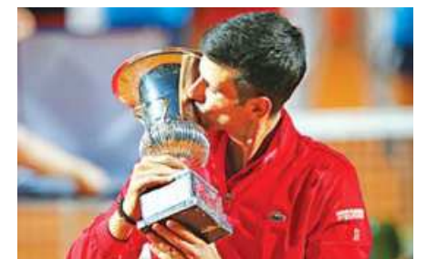
Simona Halep and Novak Djokovic pose with the trophies following their victories in the finals of the Italian Open in Rome on Monday.