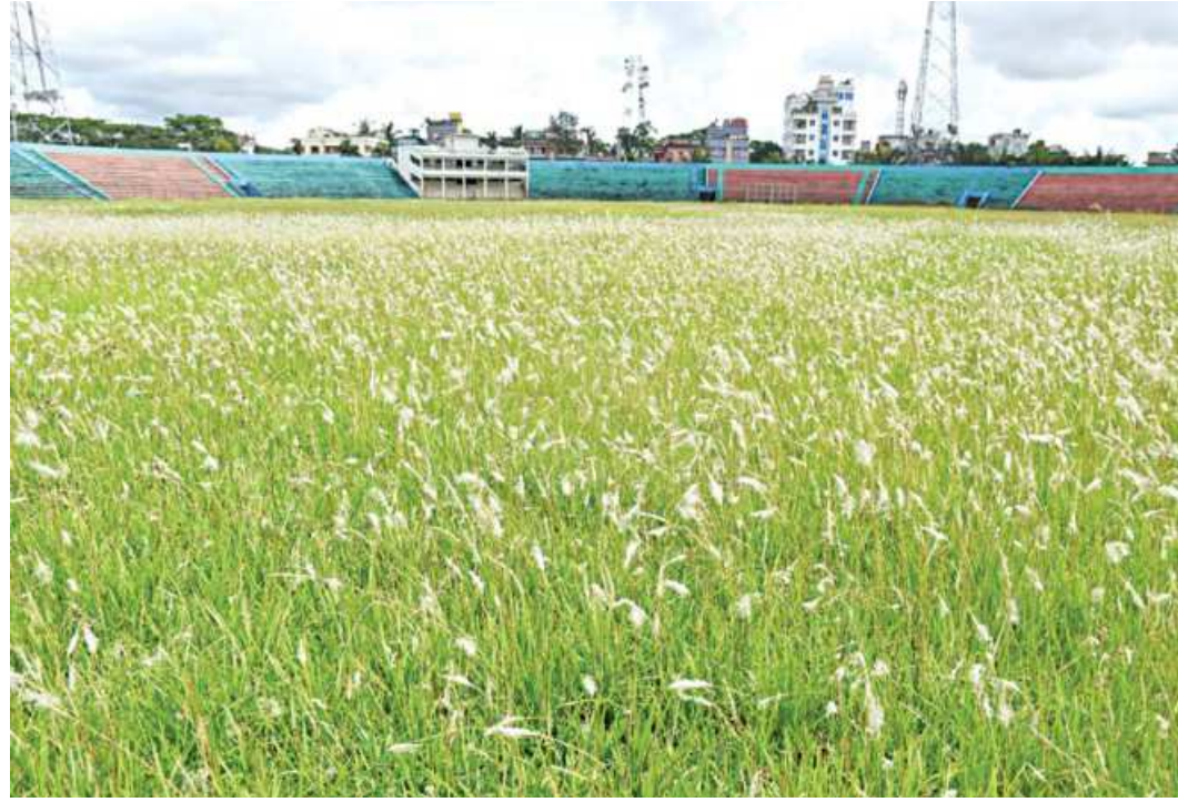
While the national cricket team have started collective training in Mirpur and other athletes are expected to begin training soon in Dhaka, sport still finds itself at a standstill outside the capital. At the Shaheed Abdur Rob Serniabat Stadium in Barishal, the length of the grass perfectly reflects the level of neglect.