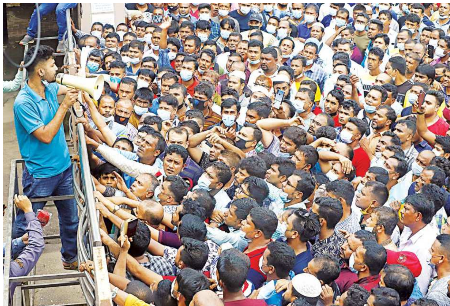
Expatriate Bangladeshis stage demonstrations outside the office of Saudi Arabian Airlines at the capital's Pan Pacific Sonargaon hotel yesterday demanding issuance of tickets for trips to the Gulf country. The protestors said their jobs will be on the line if they fail to join work by September 30. The Saudi national carrier said it cannot meet the high demand. Story on page 3.