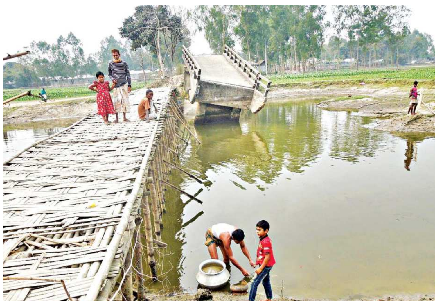
Locals have built a makeshift bridge with bamboo scaffolding next to a broken bridge on the Bhullu river in Nilphamari Sadar upazila so that they can at least cross on foot. The bridge, which links more than five lakh people of Dinajpur's Khansama upazila with Niphamari town, was damaged beyond repair during a flood in 2017. The photo was taken recently.