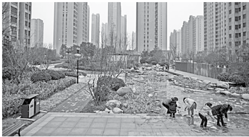
People play with ice floats at a pond in the compound of an apartment complex in Zhengzhou, Henan province, China.

REUTERS, Hong Kong China is tackling unbridled borrowing in the real estate development sector anew with caps for debt ratios. But sources at developers say a rush to get around the rules by moving more debt off balance sheets is on. Dubbed "the three red lines", Chinese regulators outlined caps for debt-to-cash, debt-to-assets and debt-to-equity ratios last month at a meeting with 12 major property developers in Beijing. Though not yet officially announced, developers expect the rules to be applied sector-wide as soon as Jan. 1, 2021. The move has sent shock waves through the industry, sources at four Chinese property developers told Reuters. "Every company is worried... so everyone is using their own methods, and it's all about off balance sheet: off balance sheet projects and off balance sheet debts," an executive at a mid-sized developer told Reuters. "Liquidity is still abundant, both onshore and offshore, you just need more innovation in fund raising." Moving debt off books by setting up ventures with other developers to purchase land is already common practice and will intensify, said the sources, declining to be identified due to the sensitivity of the matter. Other methods that effectively disguise debt as equity - such as investing in a project with a financial entity which gets guaranteed returns