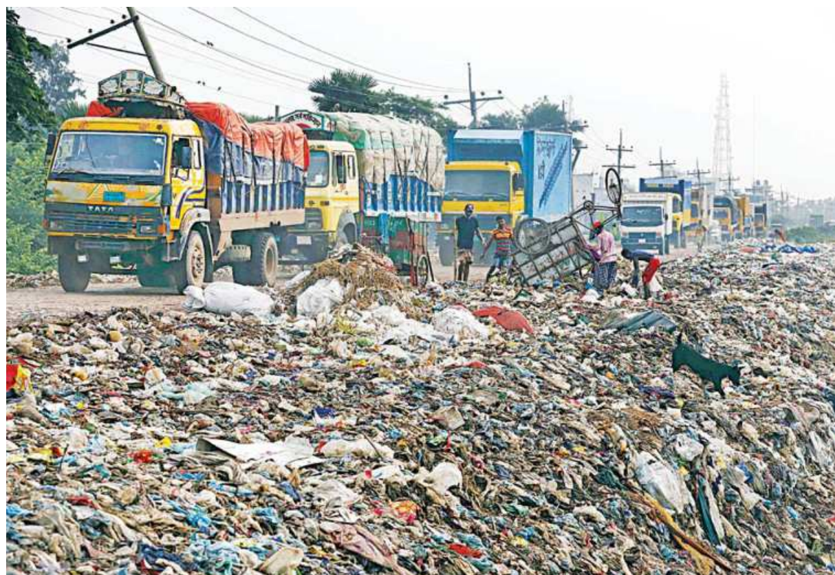
Locals dump waste on both sides of the Asian highway in Jajor area of Gazipur on a regular basis. With time, the dumped waste narrowed down the highway and has not only become a hazard for road users but also for the locals. The photo was taken yesterday.