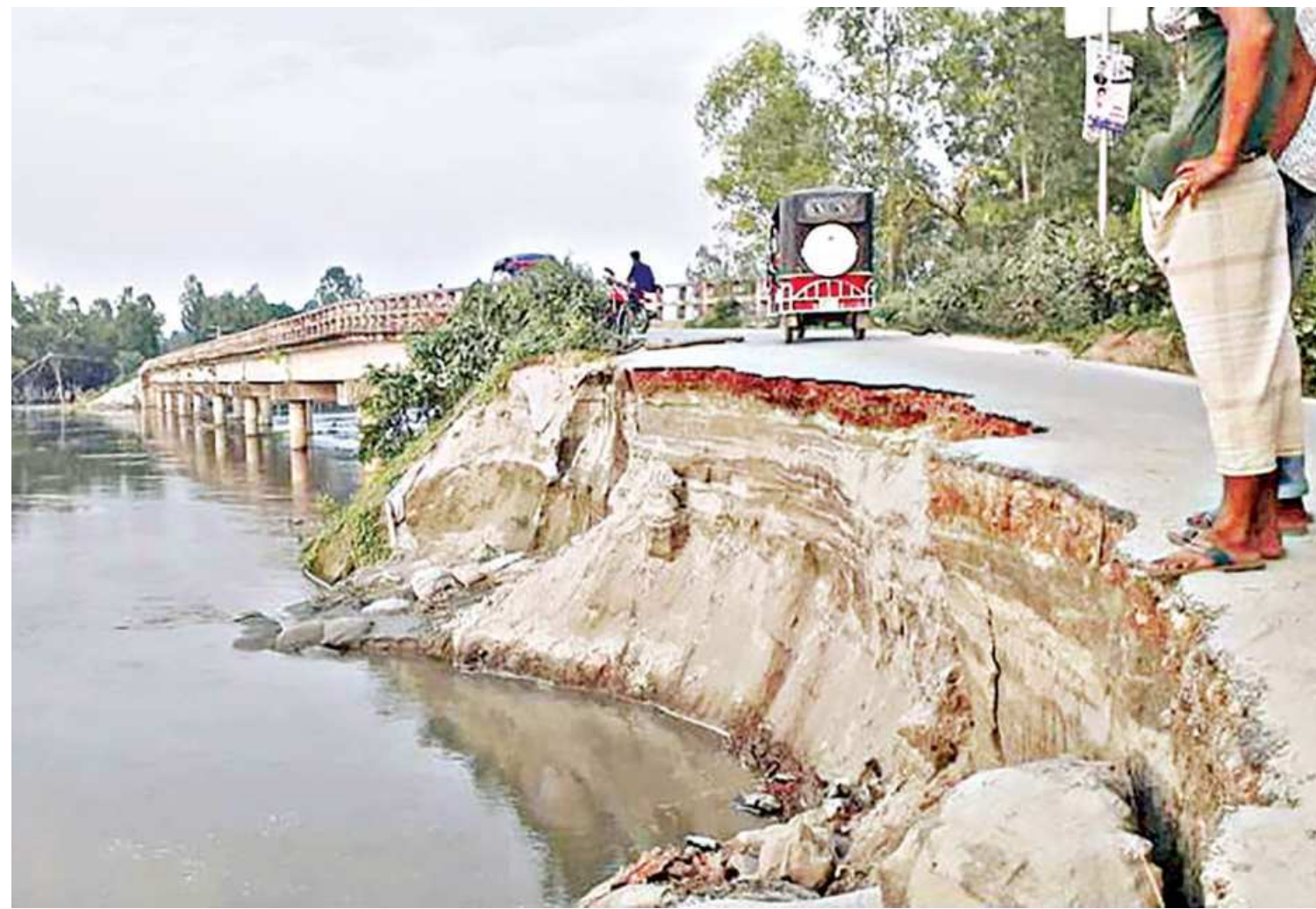
The Tangail-Torabganj road in Tangail has been hit hard by the erosion of the Dhaleshwari river with its increasing water level. The road connects four unions of Sadar upazila with the district headquarters. The road can be devoured by the river if steps are not taken quickly.