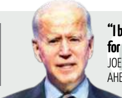
"I believe voters will make it clear -- they will not stand for this abuse of power, this constitutional abuse." JOE BIDEN BLASTS TRUMP PLAN TO PUSH FOR SC NOMINEE AHEAD OF ELECTION PAGE 6