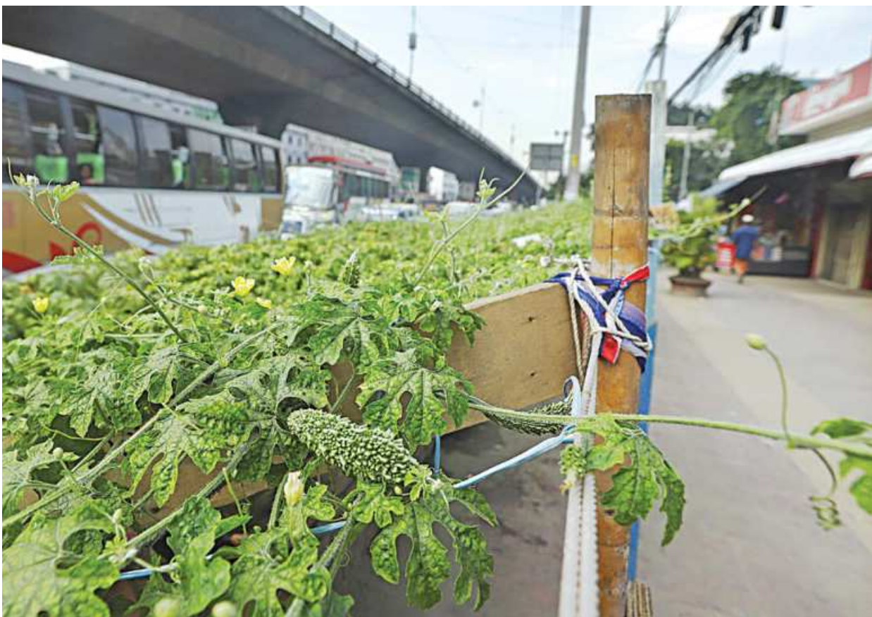
Abdur Rahim, a security guard at the capital's Mohakhali kitchen market, planted vegetables on the central reservation of the Airport Road. He got the idea after the pandemic hit the country in March and has already earned more than Tk 3,000 by selling the vegetables. The photo was taken yesterday.