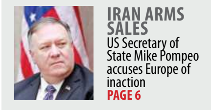
IRAN ARMS SALES US Secretary of State Mike Pompeo accuses Europe of inaction PAGE 6