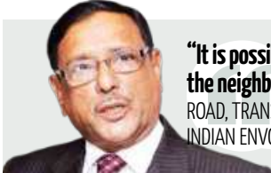
"It is possible to resolve any problem if there is mutual understanding between the neighbours... border issues and exchange of enclaves are examples..." ROAD, TRANSPORT AND BRIDGES MINISTER OBAIDUL QUADER AFTER MEETING OUTGOING INDIAN ENVOY RIVA GANGULY

REGD. NO. DA 781 | VOL. XXX No. 240 | ASWIN 7, 1427 BS | Your Right to Know | SAFAR 4, 1442 HURI | 16 PAGES PLUS LIFESTYLE PRICE : Tk12.00