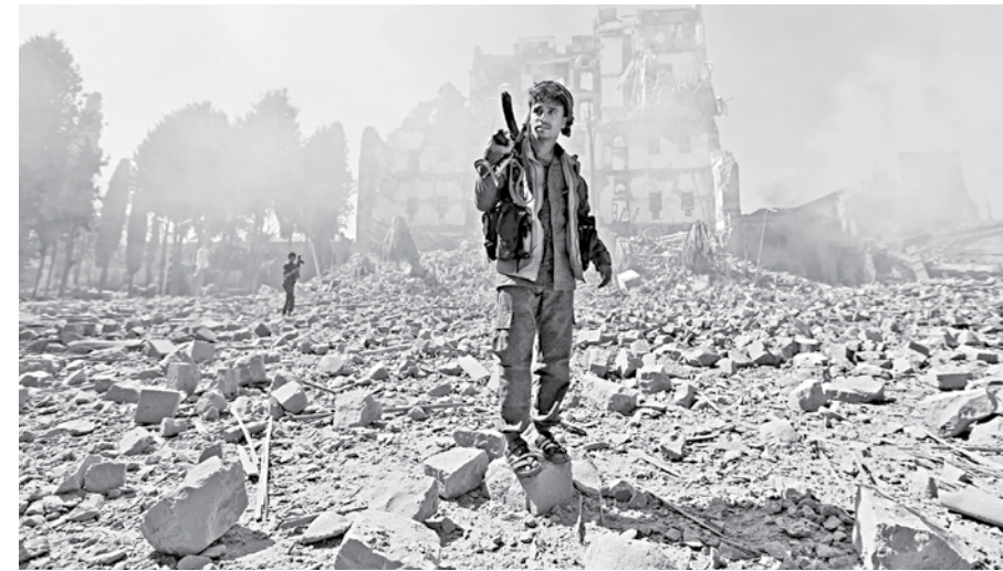
Houthi rebel fighters inspect the damage after a reported air strike carried out by the Saudi-led coalition targeted the presidential palace in the Yemeni capital Sanaa.

The newly discovered hydrocarbon resources in the Mediterranean have put Greece, Cyprus and Turkey at loggerheads