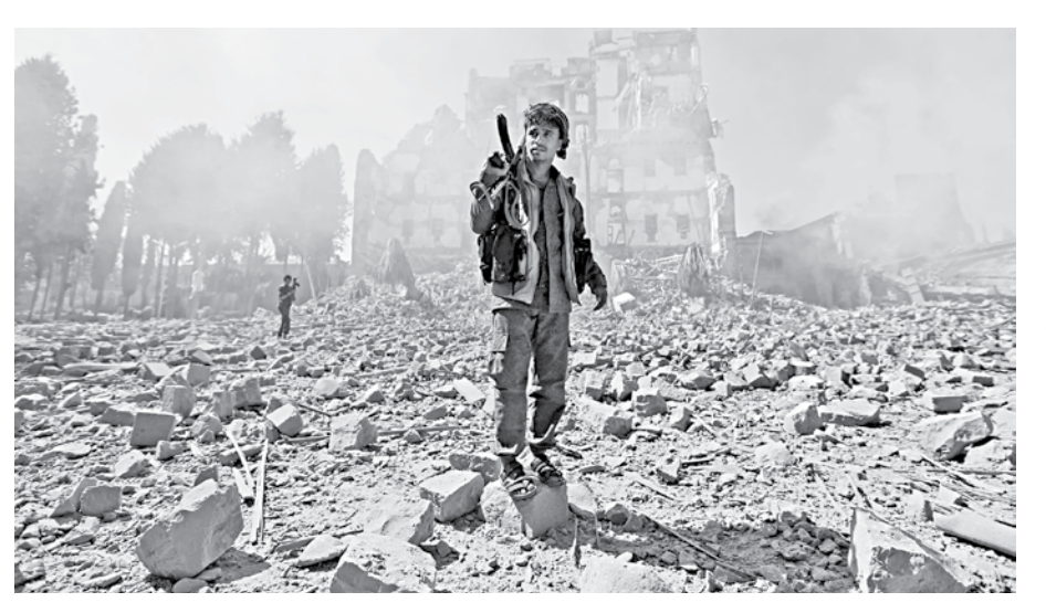
Houthi rebel fighters inspect the damage after a reported air strike carried out by the Saudi-led coalition targeted the presidential palace in the Yemeni capital Sanaa.

In Asia, the repeated Indo-Sino border misadventures have put the region on edge, with neighbouring countries appealing for calm. But with sporadic skirmishes continuing along parts of the 3,440 kilometre disputed border between