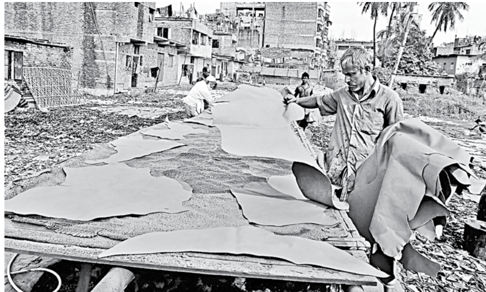
How do we justify that leather shoes are singled out for higher protective tariffs over leather bags?

First, in the absence of any theoretical guidance on the magnitude of tariff protection, Bangladesh seems to follow a path of "high" protection when compared to other developing