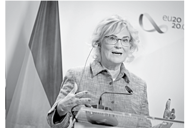
German Justice Minister Christine Lambrecht

However, defenders of insolvency protection steps say they have helped to spare Germany deeper economic contraction and prevent a spike in unemployment.