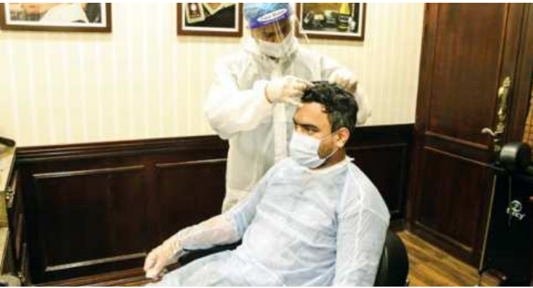
M H HAIDER, Star Lifestyle