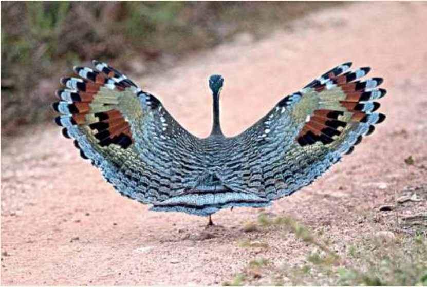
Sunbittern, the Pantanal, Brazil.