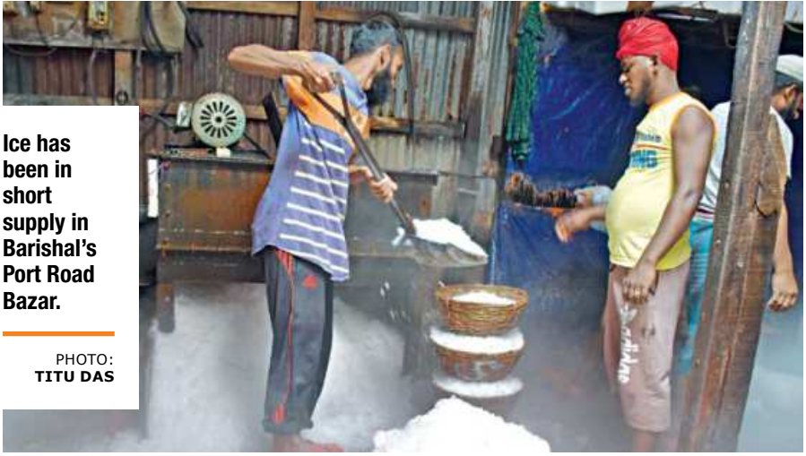
Ice has been in short supply in Barishal's Port Road Bazar.