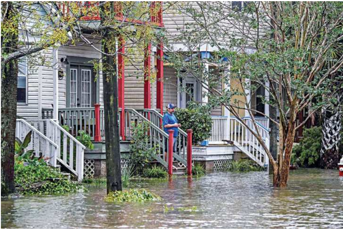
A man, standing outside of his home, watches a street flooded by Hurricane Sally in Pensacola, Florida, US on Wednesday. Hurricane Sally barreled into the US Gulf Coast Wednesday, with forecasts of drenching rains that could provoke historic and potentially deadly flash floods.

A majority of respondents in Britain (62 percent), the Netherlands and Germany (both 57 percent) said the “pandemic has shown me that most people in our country care about each other.”