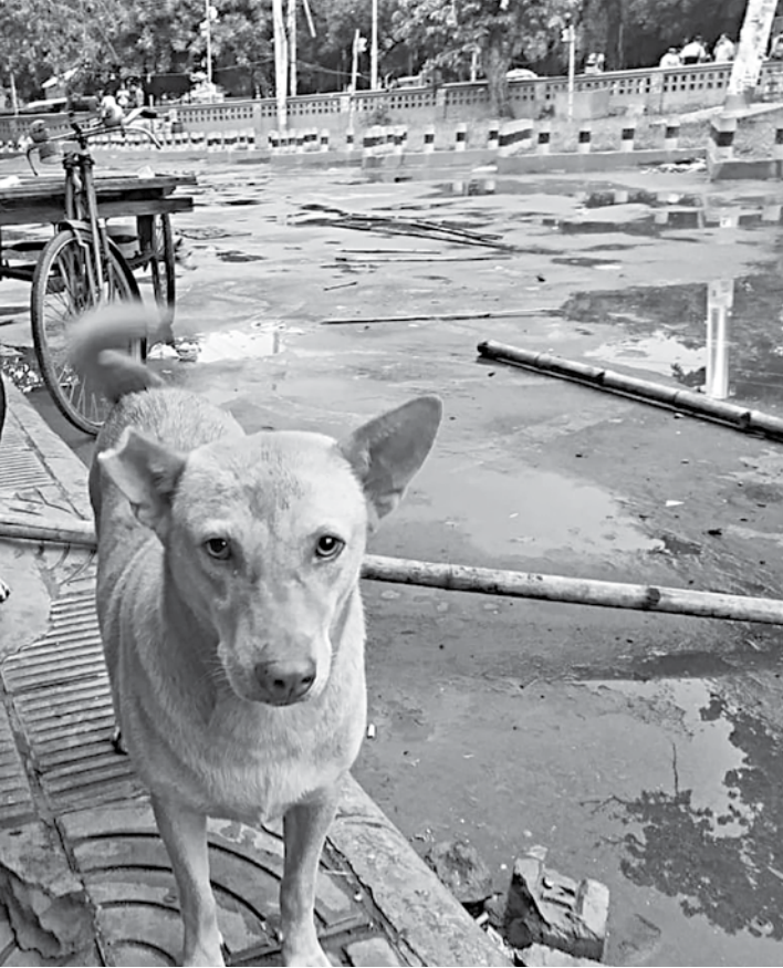
Buru, the street dog, near TSC in Dhaka University.

Across Dhaka, you will find plenty of stories of local communities caring for their dogs, like the DU students who looked after Buru. A huge number of street dogs survive on the kindness of ordinary citizens who feed them