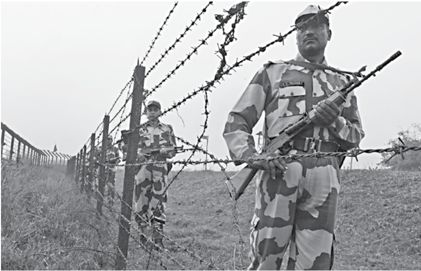
File photo of Indian Border Security Force (BSF) soldiers patrolling the border with Bangladesh near Fulbari.

The Indian public and decision makers must be convinced that it is not only Bangladesh that is dependent on India, rather India too relies on Bangladesh for a host of vital socio-economic exchanges. Bangladesh is India’s fourth highest remittance earning source. There are more than two million Indians who work in Bangladesh, documented or undocumented. Hence, the onus of maintaining a cordial relationship is on both sides.