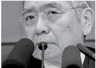
Bank of Japan Governor Haruhiko Kuroda

The world's third largest economy shrank 7.9 per cent in the second quarter of this year -- the worst figure since comparable data became available in 1980. It was in recession even before the coronavirus hit, owing to damage from a powerful typhoon last year, and a sales tax hike in October.