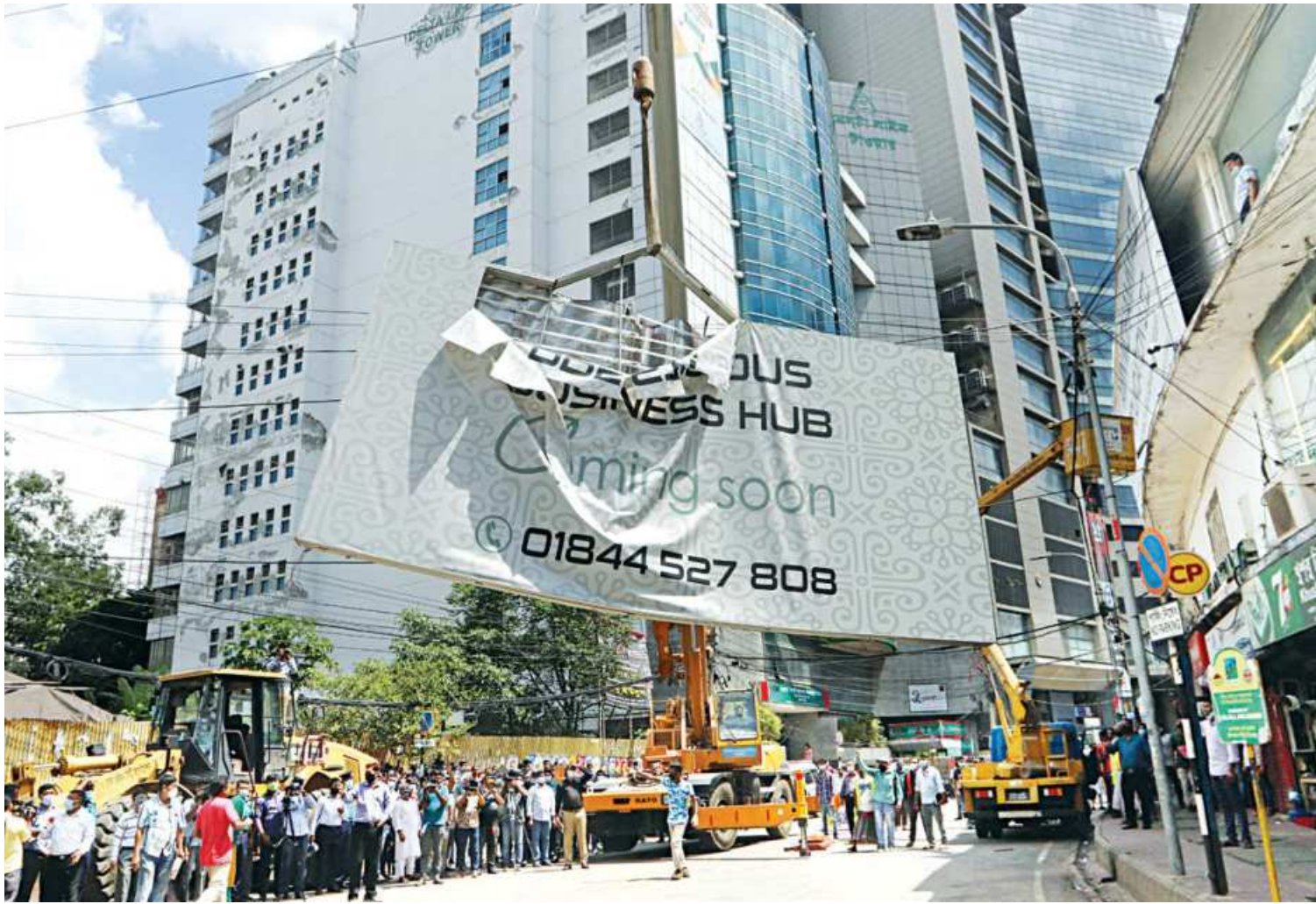
A billboard being torn down in front of the Gulshan-2 Nagar Bhaban as DNCC yesterday began its drive against illegal billboards and signboards in areas under its jurisdiction. At least 150 such structures in Gulshan 2 and 100 in Banani road 11 were also removed the same day. Several companies who have illegally occupied roads or sidewalks with billboards and signboards were also fined Tk 60,000.