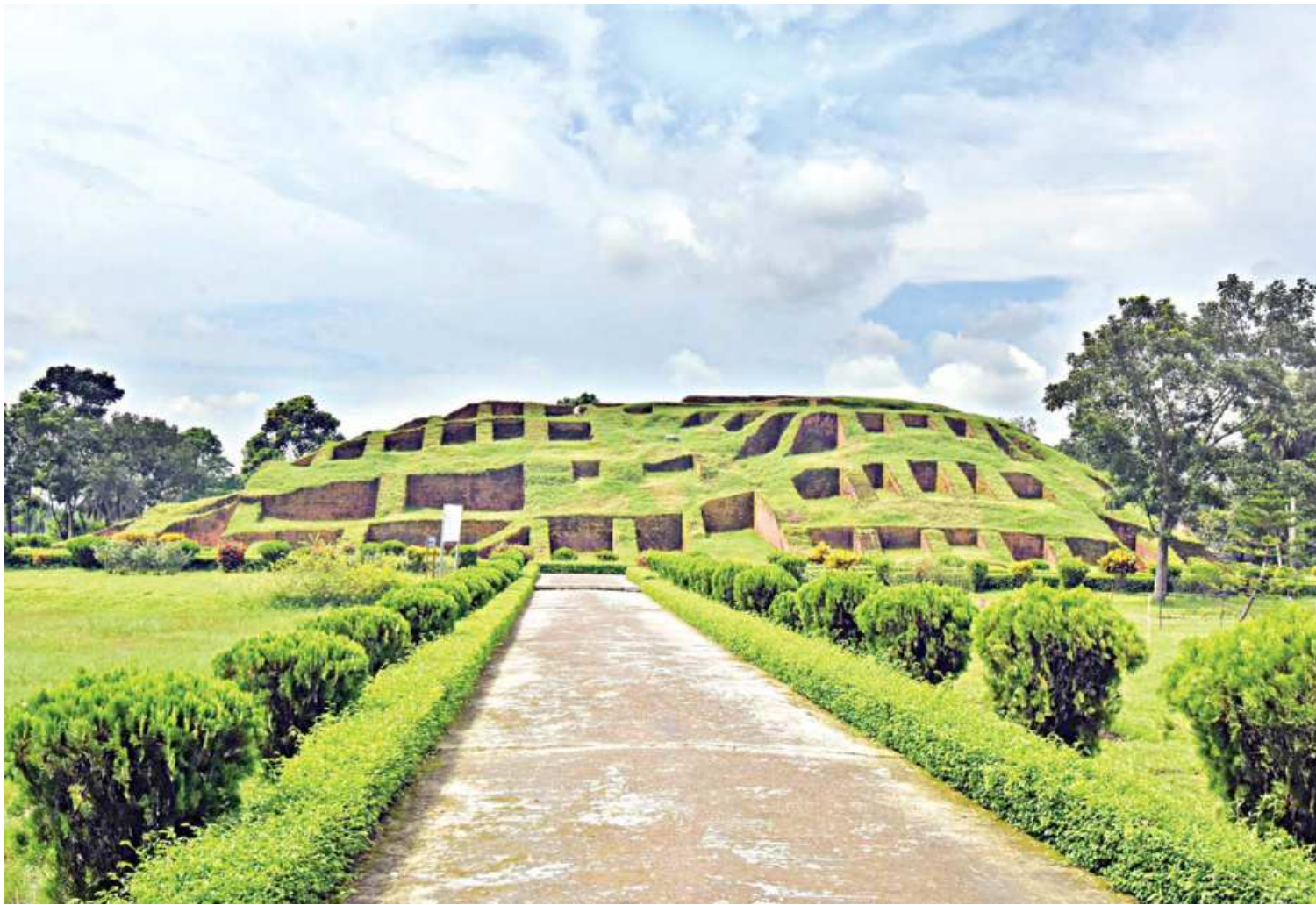
Heritage sites and museums across the country had been closed since the Covid-19 outbreak began in March. The department of archeology has decided to open the spots to the public on a limited scale from today, with the condition that visitors follow health safety guidelines. The photo was taken recently at the Behular Basar Ghor in Bogura.