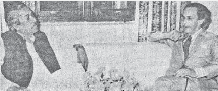
New Zealand High Commissioner Rex Cunningham talking to Prime Minister Bangabandhu Sheikh Mujibur Rahman on September 16, 1972.