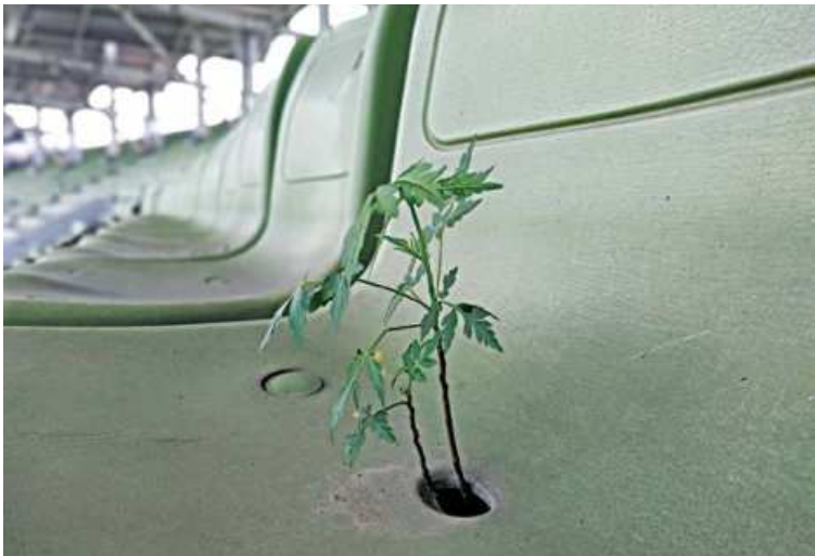
The long absence of cricket – both domestic and international – has had an impact on the home of cricket, with shoots springing up from beneath the seating arrangements at the gallery.

Ever since cricket was halted, there was always talk of bringing it back, preferably with domestic leagues. And with the BCB boss now confidently talking about it,