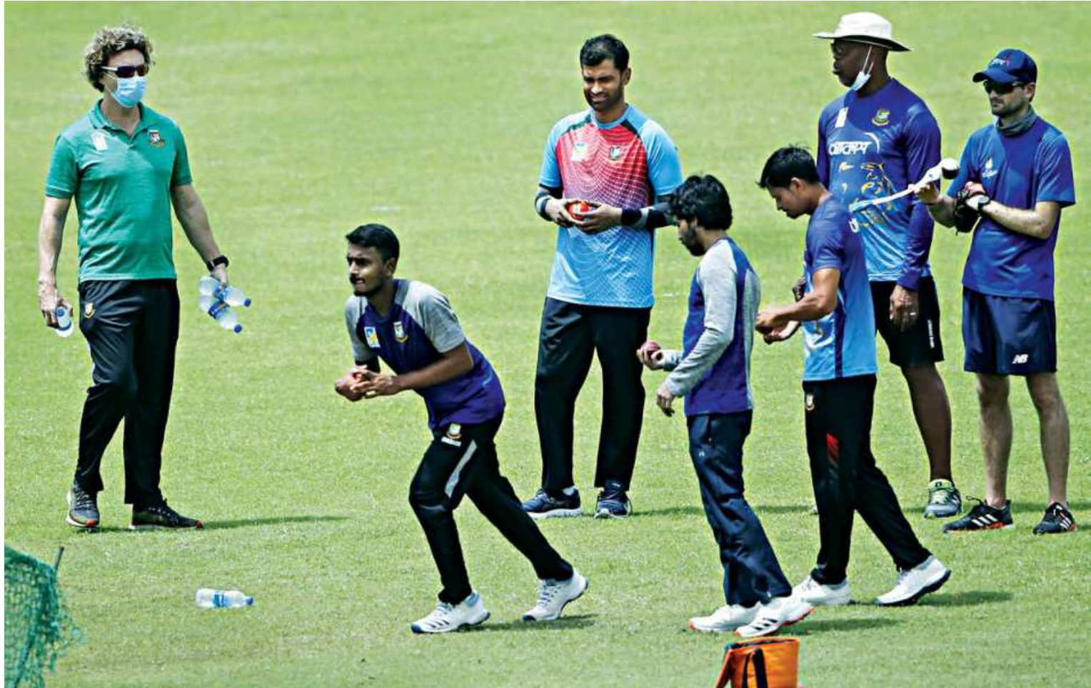
Despite the roadblock that Bangladesh's scheduled tour of Sri Lanka has come up against, the national players yesterday continued their training at the Sher-e-Bangla National Stadium in Mirpur under the supervision of foreign coaching staff.