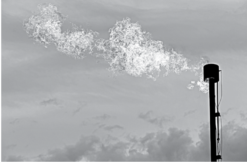
A flare burns off excess gas from a gas plant in the Permian Basin in Loving County, Texas, US.

"Some countries are finding ways through credit systems and other mechanisms to price carbons... It's what's really needed for carbon