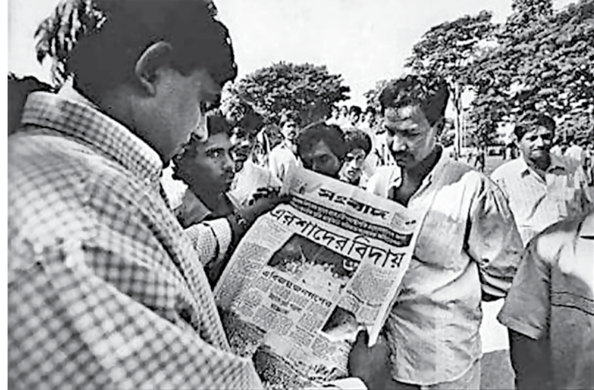
Democracy has had a bumpy ride in Bangladesh from the seminal stages of its emergence.

the ruling party walked over the bloodstained body of the Father of the Nation and his family members, to join the cabinet of Mushtaq, military and supra political changeovers have had political acquiescence of sorts. Military rulers are encouraged when their illegal takeovers that topple an elected government are not met by vigorous opposition by the politicians. The 1986 elections under Ershad had not only given a lease of life to the Ershad regime but validated his