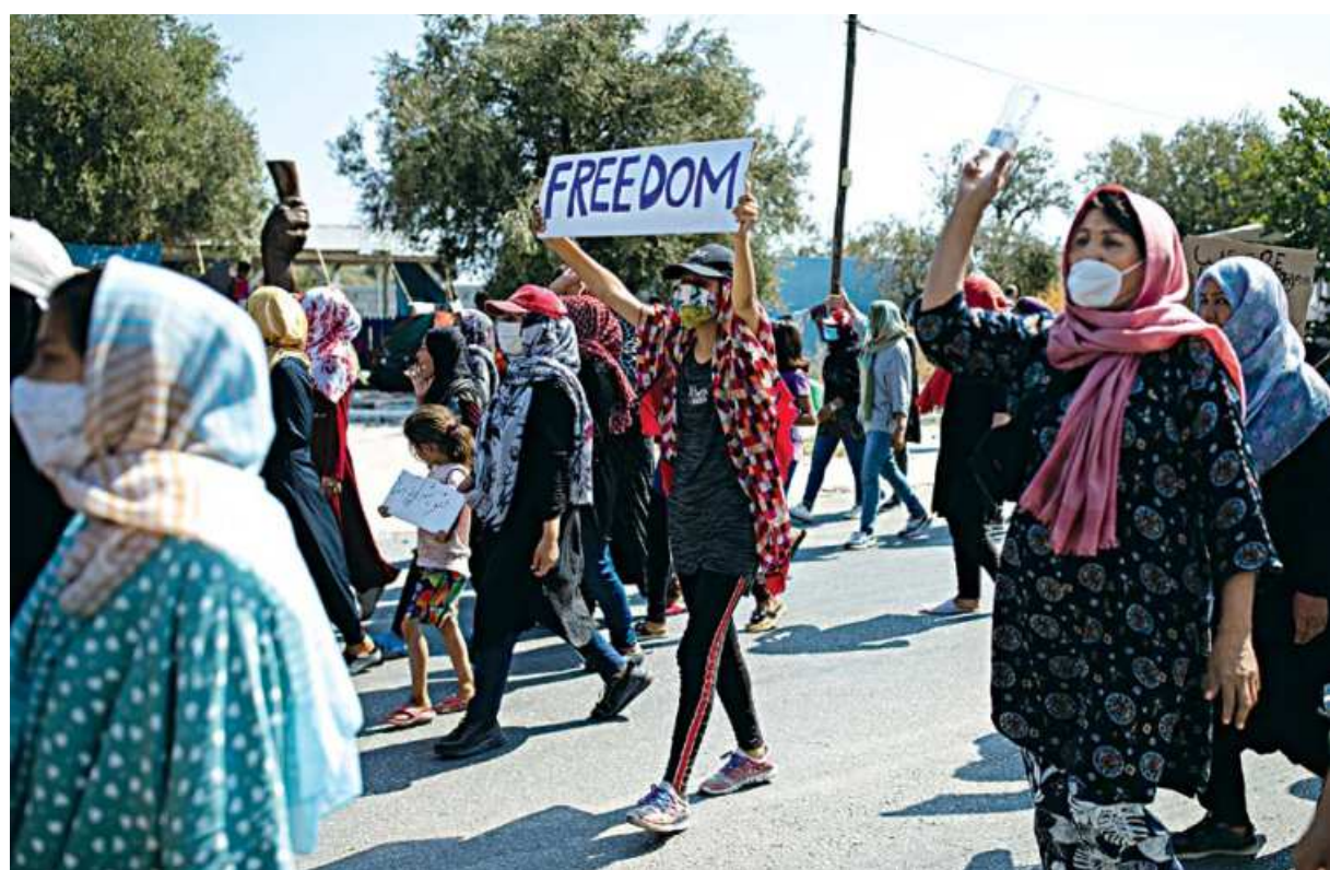
Refugees and migrants from the destroyed Moria camp protest near a new temporary camp, on the island of Lesbos, Greece yesterday. More than 12,000 people, mostly refugees from Afghanistan, Africa and Syria, are without shelter and are having to sleep out in the open without proper sanitation after the fire tore through the Moria migrant camp last Wednesday.