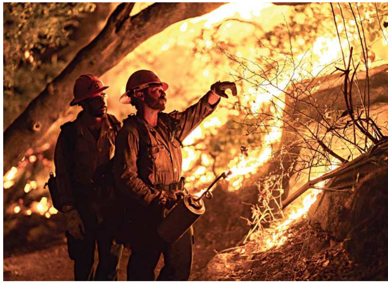
Firefighters set a backfire to protect homes during the Bobcat Fire in Arcadia, California, US on Sunday night. California wildfires have already incinerated a record 2.3 million acres this year and are expected to continue till December.

"Civilian casualties have also been increasing. In some cases, they appear to have been targeted or attacked indiscriminately, which may constitute further war crimes or even crimes against humanity," she said.