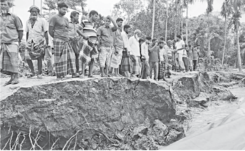
Jamuna erosion has devoured a number of houses and vast tract of croplands in Tangail Sadar upazila.

He added that the authorities do some works to check the erosion during