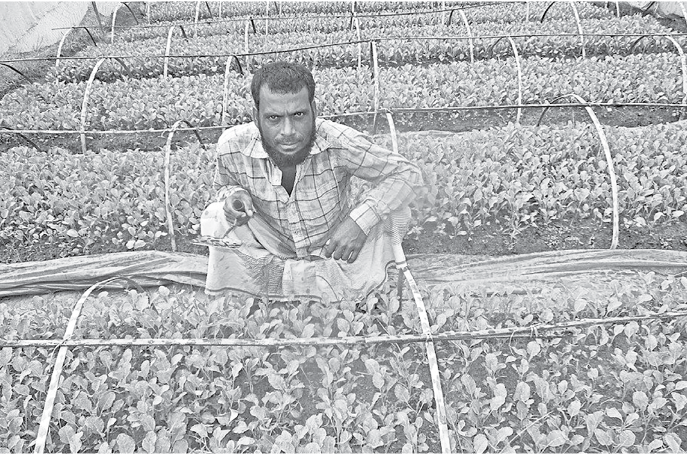
A recent photo of a seedbed of an early winter vegetable variety of cauliflower at Bhashanipara village in Nilphamari Sadar upazila.