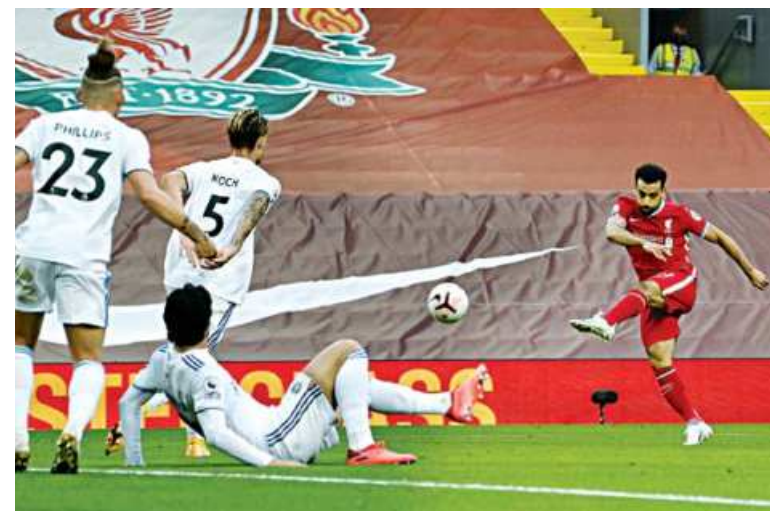
Mohamed Salah lit up Anfield with a cracking hatrick, including this sublime volley, in Liverpool's 4-3 win over Leeds United on the opening day of the Premier League season on Saturday.

Salah scored two penalties in his hatrick to bookend the scoring, the first in the fifth minute and the last in the 87th, along with a rasping half-volley. Virgil Van Dijk scored the other while Jack Harrison, Patrick Bamford and Mateusz Klich netted for Leeds.