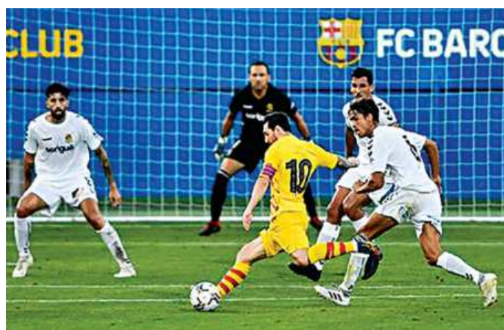
Lionel Messi started and played 45 minutes in Barcelona's pre-season friendly against Gimnastic de Tarragona at the Johan Cruyff Stadium on Saturday.

He started Sergio Busquets and Carles Alena in the middle in the first half and then Frenkie de Jong and Riqui Puig, as he changed his