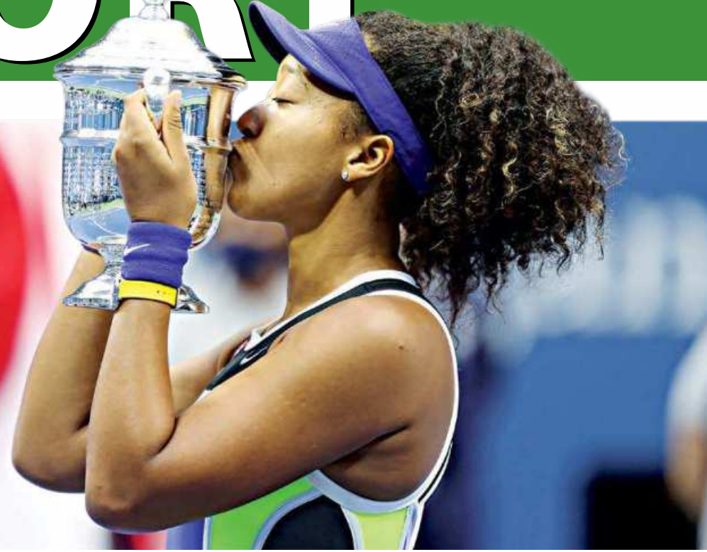
Naomi Osaka kisses the US Open trophy after beating Victoria Azarenka in a three-set final at Flushing Meadows on Saturday. (Bottom) The 22-year-old wore a different face mask for each of her matches, each carrying the name of Americans that were slain by members of police. With no fans in the stands this year, for her it was all about bringing Black Lives to the front seat.

This was the third US Open final defeat for the two-time Australian Open winner.