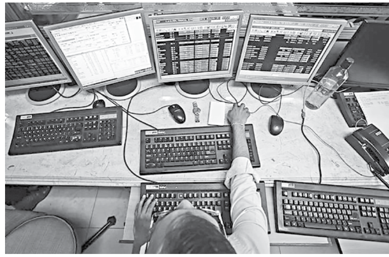
A broker monitors share prices while trading at a brokerage firm in Mumbai.

The rules are being drafted by the finance and corporate affairs ministries, in discussion with the capital markets regulator Securities and Exchange Board of India (SEBI), and will be finalised in