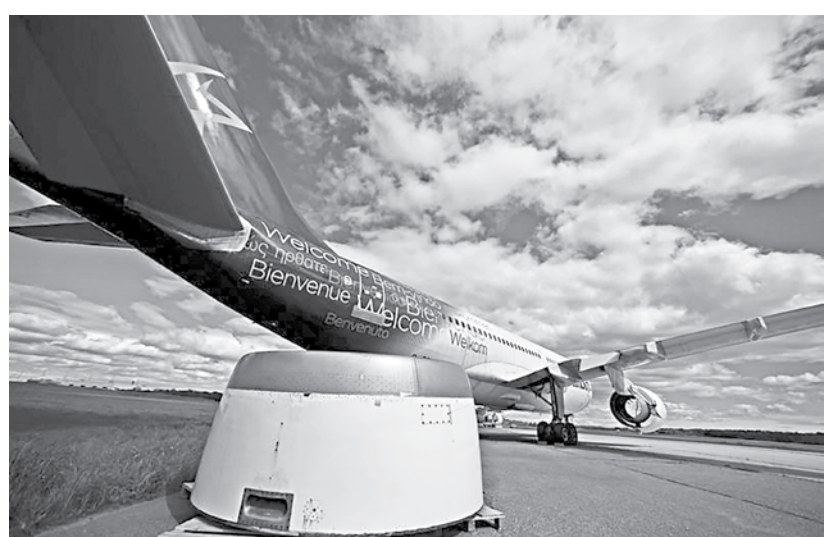
The cap for an engine casing sits on the tarmac behind an Airbus A-310 airplane at airplane recycling company Aerocycle in Quebec, Canada.

Gregory said Air Salvage was approached by an aircraft leasing company about dismantling several A380s, but with only about 5% of the jumbo jets still active according to Naveo, demand is slim for their parts.