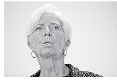
European Central Bank President Christine Lagarde

"Confidence in the private sector rests to a very large extent on confidence in fiscal policies," Lagarde said in a speech. "Continued expansionary fiscal policies are vital to avoid excessive job shedding and support household incomes until the economic recovery is more robust."