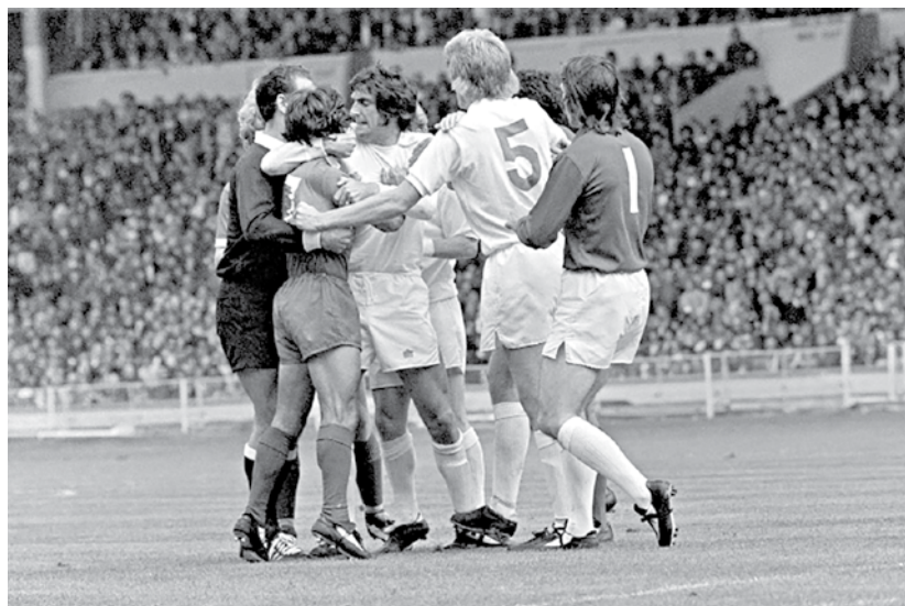
Bust-ups, like this one between Liverpool's Kevin Keegan and Billy Bremner of Leeds, were commonplace back in the day.

Leeds United have waited 16 long years to return to the Premier League and Marcelo Bielsa's side will get a very clear reminder of what they are now up against when they face champions Liverpool at Anfield in Saturday's season opener. While the Yorkshire club have work to do to re-establish themselves in the Premier League, the fixture brings back memories of great clashes between the clubs in the early 1970s when they were among the top teams in the country. That period included a memorable Charity Shield game in 1974 when Kevin Keegan and Billy Bremner were sent off after punches were thrown at Wembley. Pressing rather than punching is likely to be the order of the day on Saturday and it will be fascinating to see Leeds play their high-energy approach against Klopp's similarly relentlessly attack. Analysis by Gracenote reveals that this season's competition will contain the highest number of former league champions