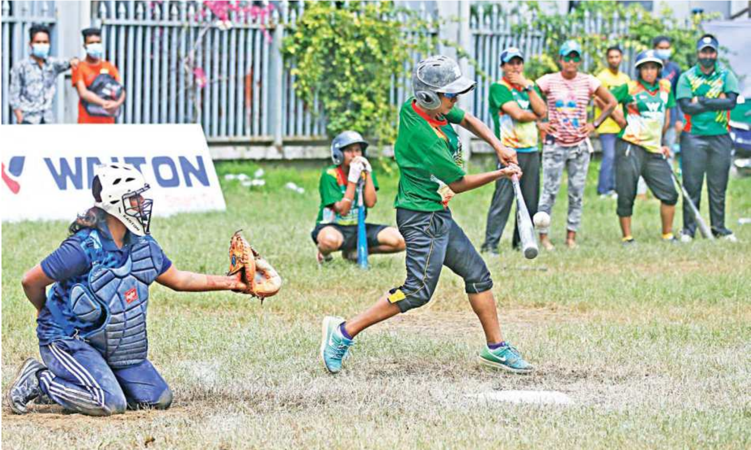
A batter of Bangladesh Ansar & VDP makes solid connection as her teammates watch intently during the final of the 4th Walton National Women's Baseball Championship against Bangladesh Police at Paltan Maidan yesterday. Ansar won the final by 17-10 points to claim their fourth title in this American sport, which is trying to make its presence felt on the sporting landscape of this country.