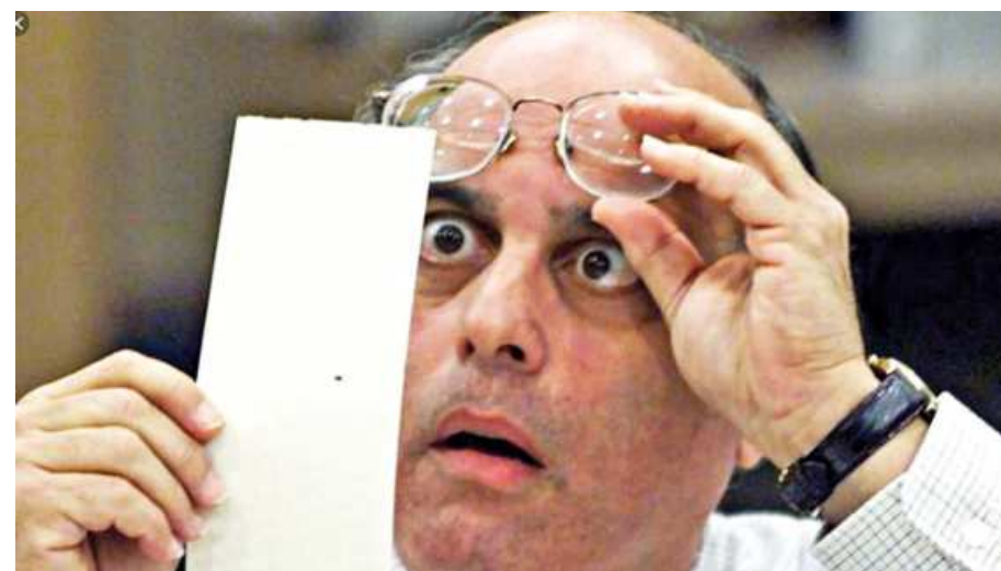
An iconic photo of the 2000 Florida election debacle where a bemused public was introduced to the esoteric pleasures of "hanging chads" and "pregnant chads".