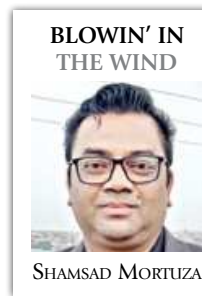
BLOWN' IN THE WIND

love. Figuratively speaking, the power of true love is such that water cannot wash away the feelings with the passing of time. The return of a teenage girl who was supposedly raped and killed in Narayanganj made me hum these lines.