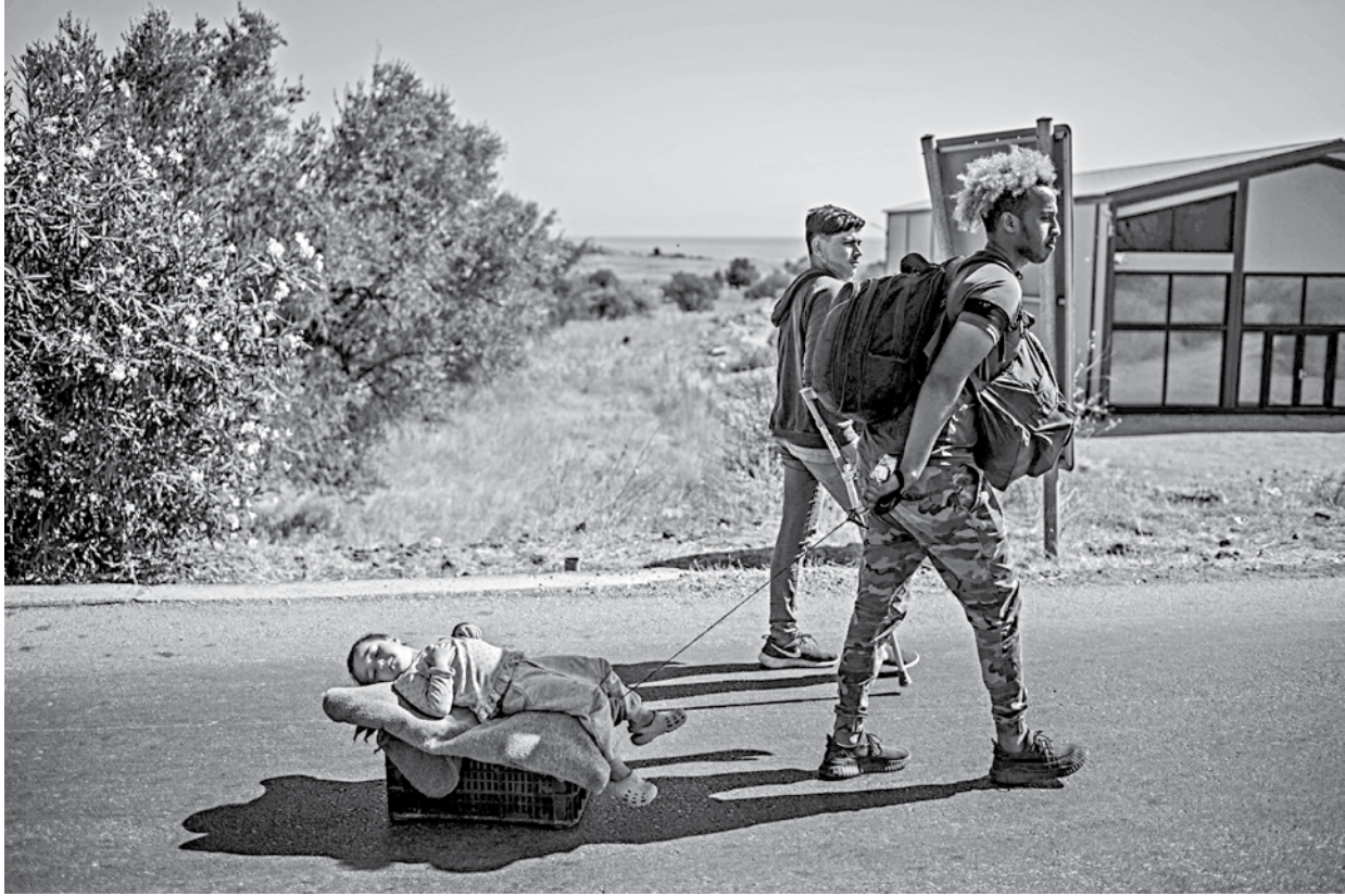
A migrant pulls girl asleep on a box on the road near Mytilene on the Greek island of Lesbos, yesterday, a few days after a fire destroyed the Moria refugee camp. Ten EU member states have agreed to take in a total of 400 unaccompanied minors left homeless after the fire laid waste to the biggest migrant camp in Greece.

The victim was sent to Noakhali General Hospital for medical tests.