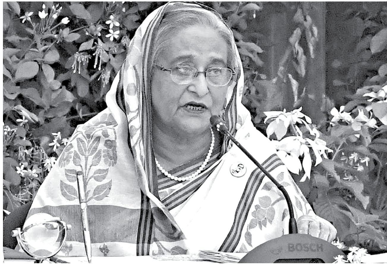
Prime Minister Sheikh Hasina addressing the Armed Forces Selection Board Meeting 2020 from her official Gono Bhaban residence through video conference, on September 7, 2020.

If we are to really heed Sheikh Hasina’s call, and we think we should and must, we must remove all reasons and causes for the military’s involvement in civilian life. We must stop using them for political purposes, especially suppressing the opposition and shutting down dissenting views.