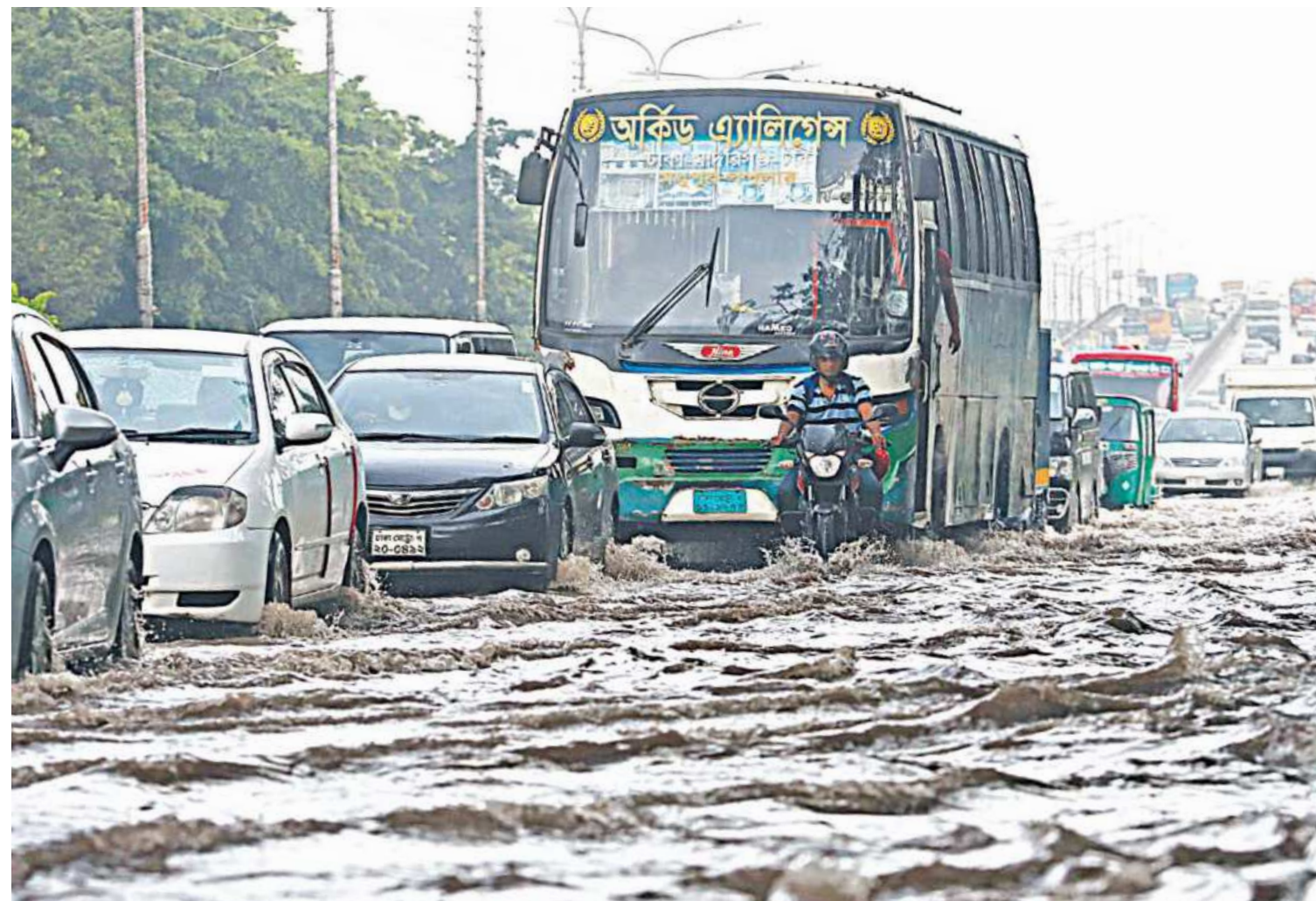
Waves crash into the sidewalk as vehicles pass the flooded Airport Road near the Banani flyover yesterday. Many streets were left inundated after heavy rainfall in the afternoon. The city's drainage system is often clogged or inadequate at places to drain the water.