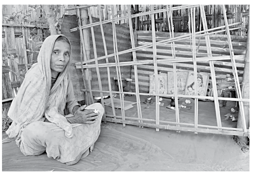
File photo of a Hindu woman praying at her home in Kurigram, Bangladesh, on June 11, 2015.

The plight of Hindu women in Bangladesh can be further attributed to the woeful lack of female Hindu legislators in parliament. Since 2008, the number of male Hindu MPs in the 9th, 10th and 11th parliaments has been 14, 15 and 16 respectively. On the