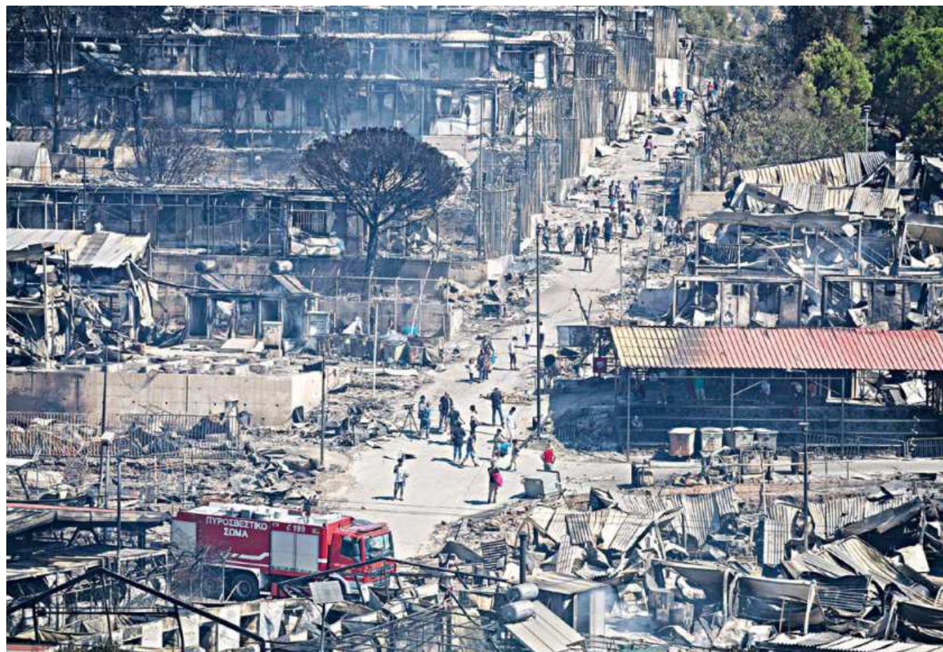
Refugees and migrants make their way next to destroyed shelters following a fire at the Moria camp on the island of Lesbos, Greece, yesterday. Thousands of asylum seekers were left homeless yesterday after fleeing for their lives as a huge fire ripped through the camp, the country's largest and most notorious migrant facility. The fire destroyed most of the overcrowded, squalid camp.

Officials and diplomats have warned that rising violence is sapping trust needed for the success of talks aimed at ending an insurgency that began when the Taliban was ousted from power in Kabul by US-back forces in late 2001.