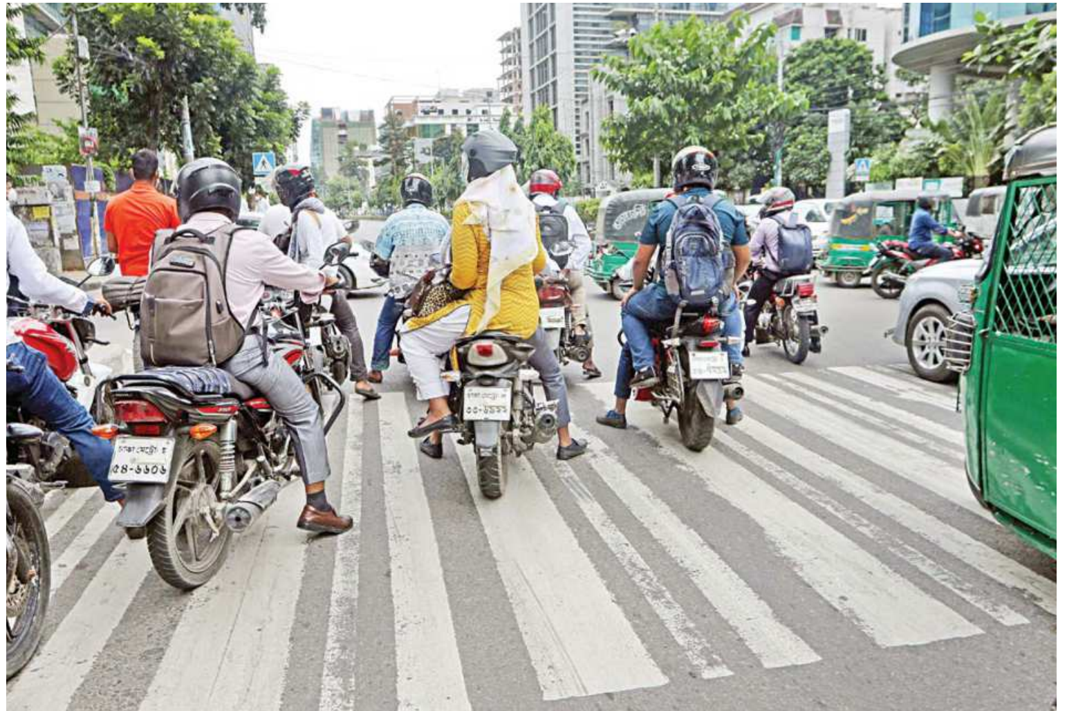
Vehicles, mainly motorcycles, stop on a zebra crossing on the capital's Gulshan Avenue. Such violation of traffic rules, which is quite common across the city, forces pedestrians to walk on busy streets, putting their lives at risk. The photo was taken yesterday.