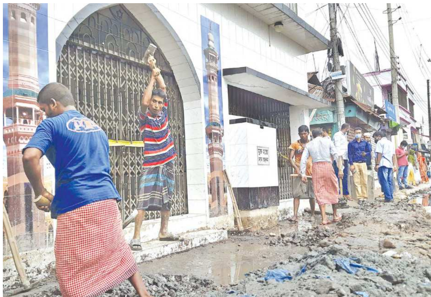
Workers hired by Titas Gas dig the ground in front of Pashchim Talla Baitus Salam Mosque in Narayanganj yesterday. Later in the day, a pipeline of Titas was found there. A fire at the mosque on Friday night, believed to be caused by gas from a leaking pipeline, killed 27 people and burnt a dozen others.